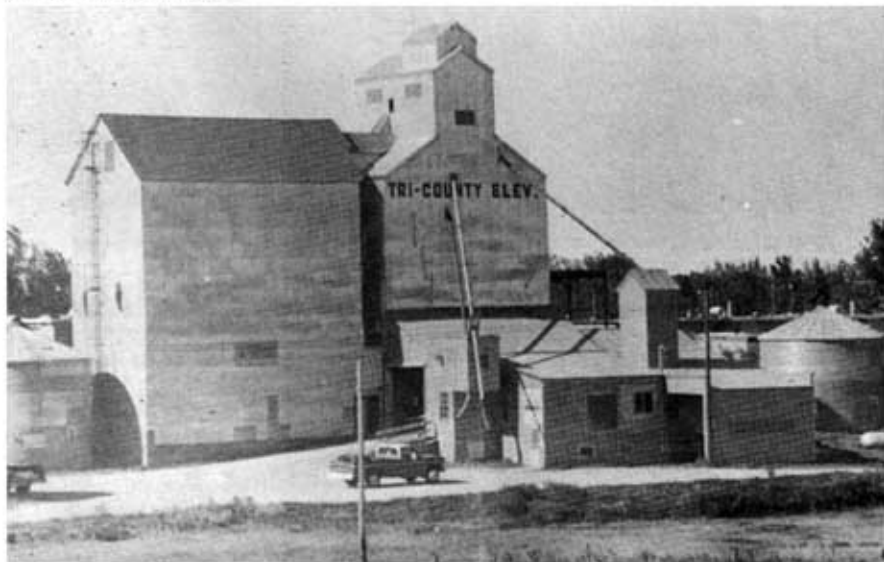
Elevator—feeding the people of the world. Shiny, metallic walls and machinery present esthetic shapes common to this area.