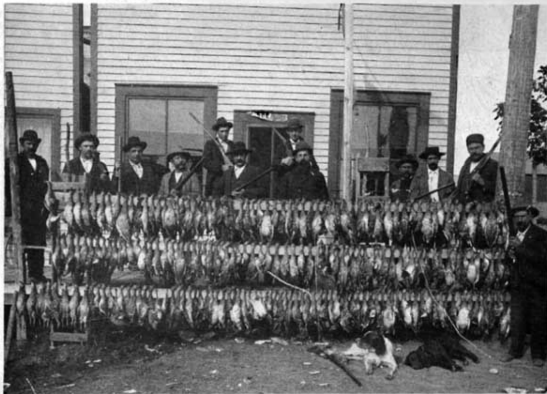
Hunting around Wishek in better days. Names of men cannot be identified. Photo is believed to be from about 1910.