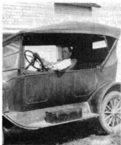
Proud owner of a horseless carriage.