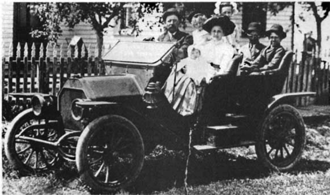
Taking a ride in Zeeland in early 1900s.