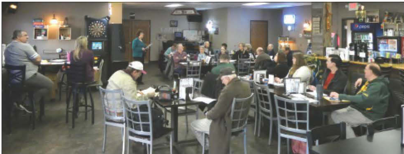
Over 20 Tri-County Tourism Alliance members attended the annual meeting on Jan.11 at the White Maid Restaurant and Bar in Napoleon.