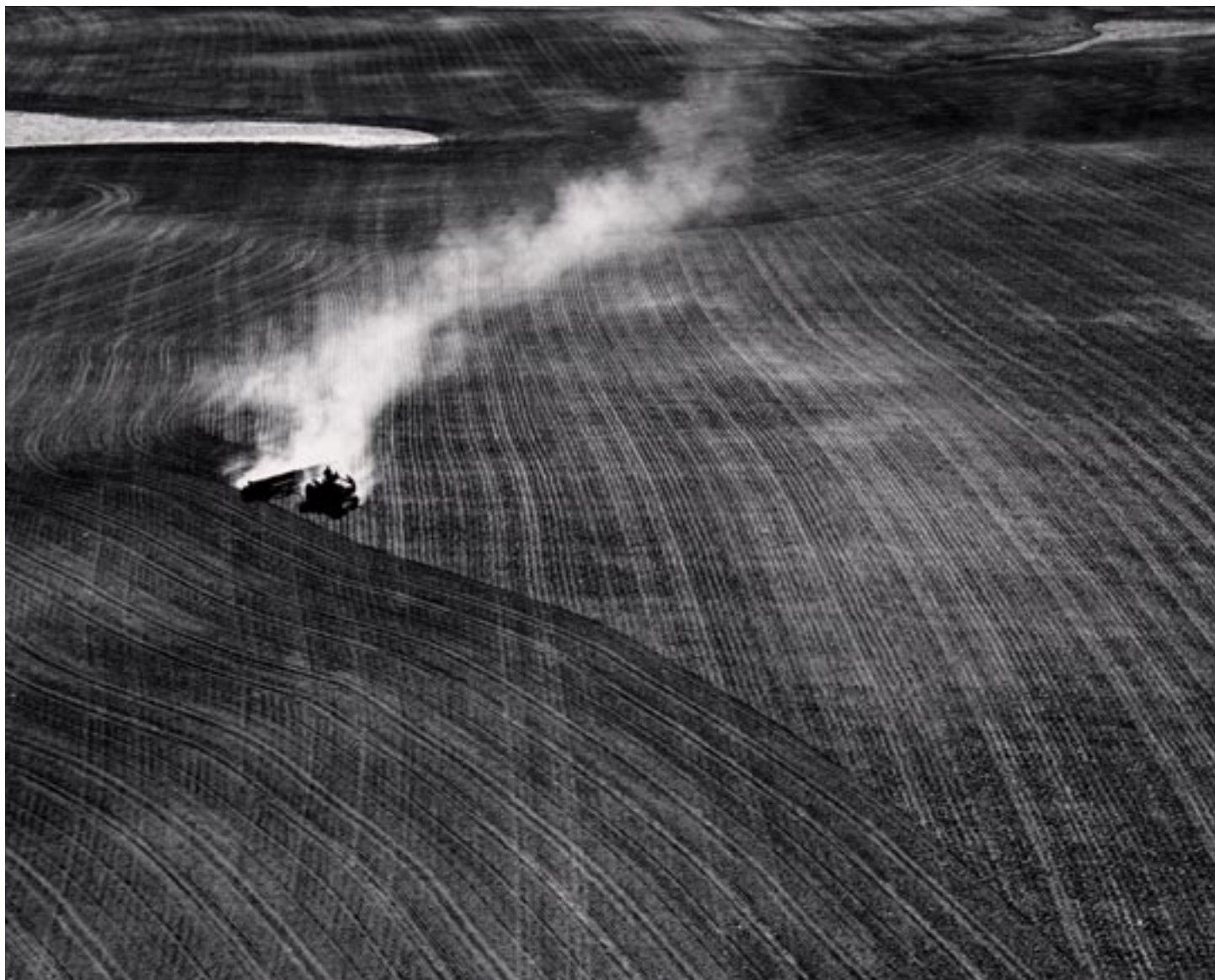
Dust rises from a drill seeding dryland grains in the Lincoln Valley area of the Garrison Diversion Unit, North Dakota, 1973.