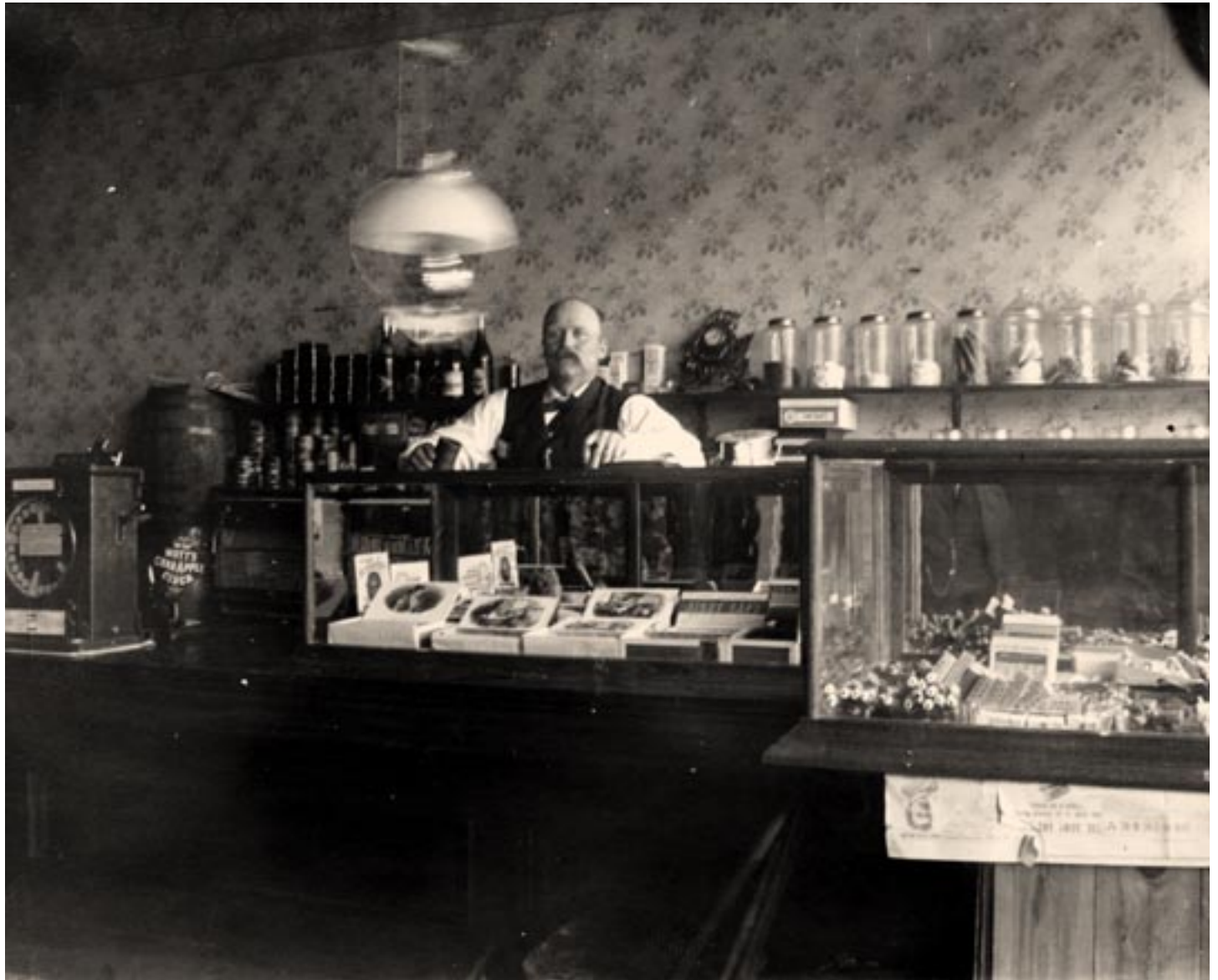
Selling candy and cigars, 1900s. (Fred Hultstrand History in Pictures Collection, IRS, NDSU, Fargo, 2028.380)