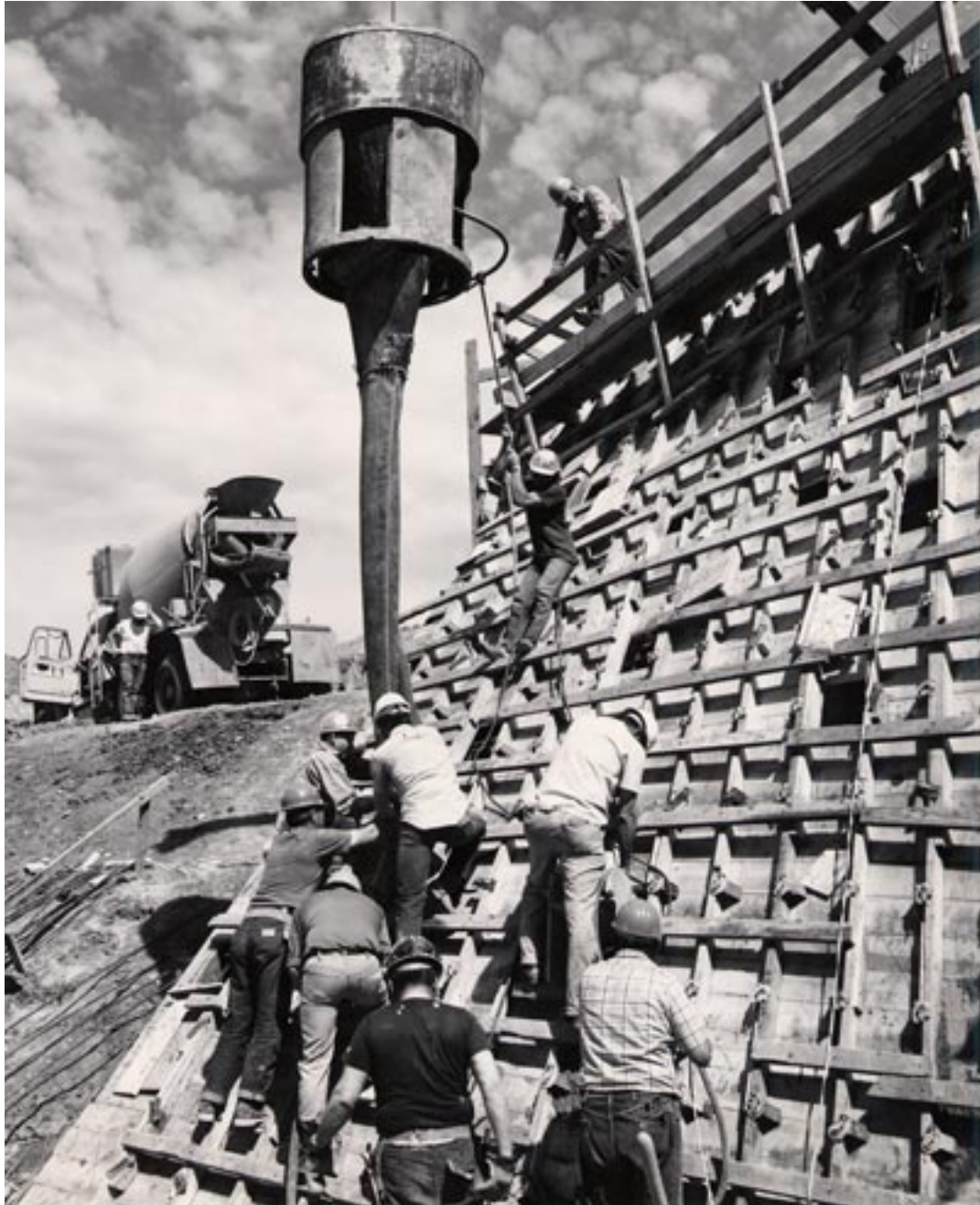
Concrete work on the McClusky Canal, ND, 1972.