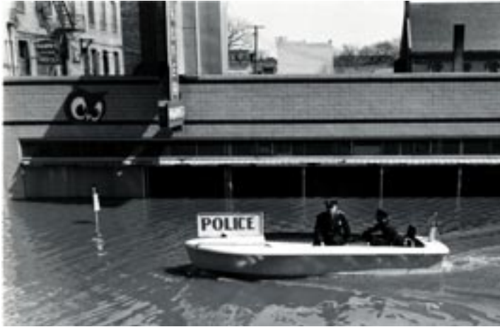
Police officers patrolling flood waters in front of the Red Owl supermarket, Fargo, 1952.