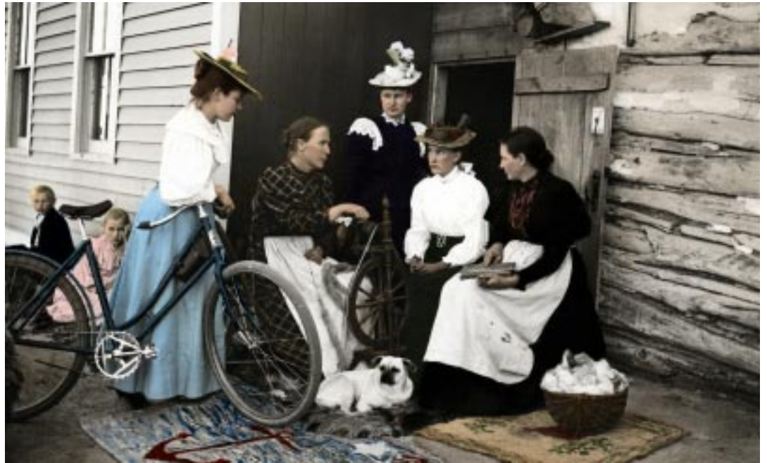
A lesson in spinning, demonstrating with an Icelandic spinning wheel, 1900s.

“How shamed ladies’d be to have hands and arms like mine and how weak they’d be to do my work and how shocked to touch the dirty things even what i black my whole hands with everyday—yet such things must be done and the lady’s’d be the first to cry out if they was to find nobody to do it for ’em—so the lowest work i think is honourable in itself and the poor drudge is honourable too providing her mind isn’t coarse and low as her work, both cause its useful and for be’en content with the station she is placed in.”