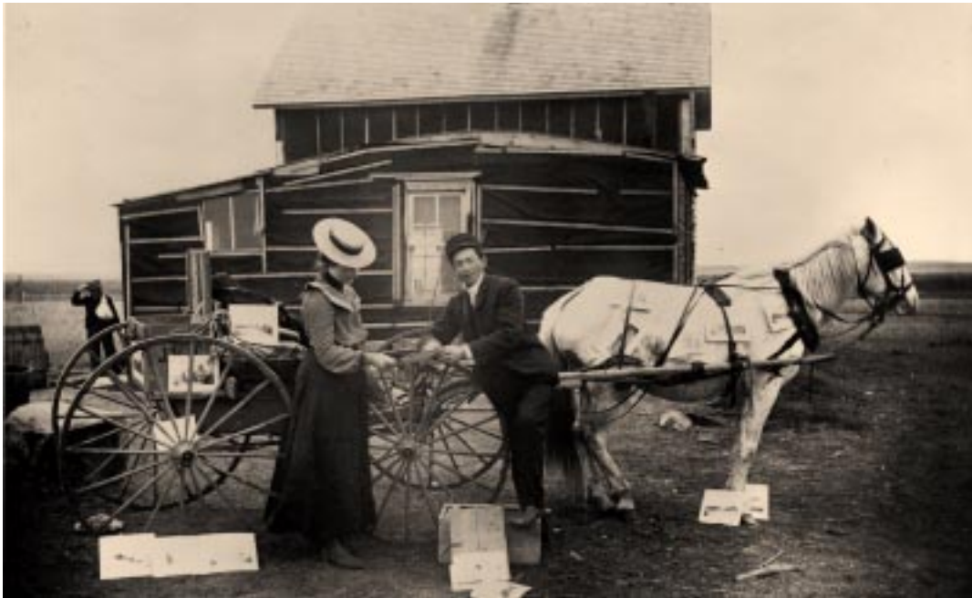
The itinerant photographer displaying his wares, 1900s.

“There was a good deal of outdoor singing in those days. Workmen sang at their jobs; men with horses and carts sang on the road; the baker, the miller’s man, and the fish-hawker sang as they went from door to door; even the doctor and parson on their rounds hummed a tune between their teeth. People were poorer and had not the comforts, amusements, or knowledge we have to-day; but they were happier. Which seems to suggest that happiness depends more upon the state of mind, and body, perhaps, than upon circumstances and events.”