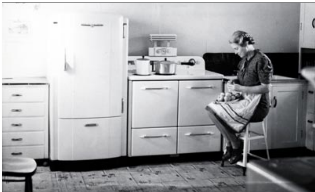
Peeling apples, 1940s.

“In modern times there are still many people who, without being slaves, nevertheless work for little or no payment: for example, housewives, schoolchildren, the so-called ‘unemployed’ and the retired...It seems odd to regard a house-painter as working when he paints other people’s houses for money, but not when he paints his own in his spare time; or to say that writers have ceased to work when they leave their word-processors and go to do some overdue digging in their gardens.”