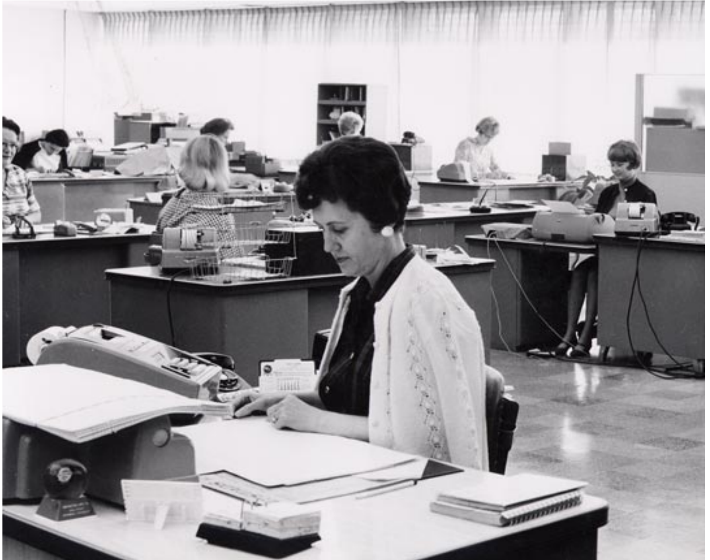
Office workers at Cass-Clay Creamery, Inc., 1967.