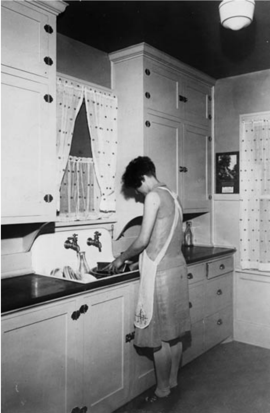
Washing dishes, 1920s.