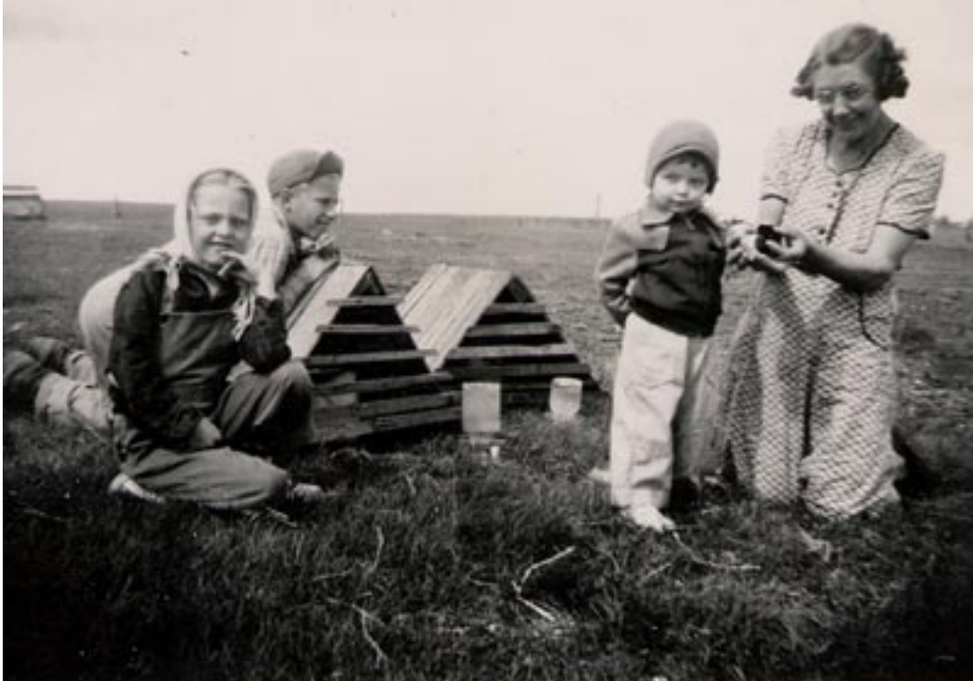
Feeding the chick-ees. Rustad Farm in Williams County, ND, 1951.