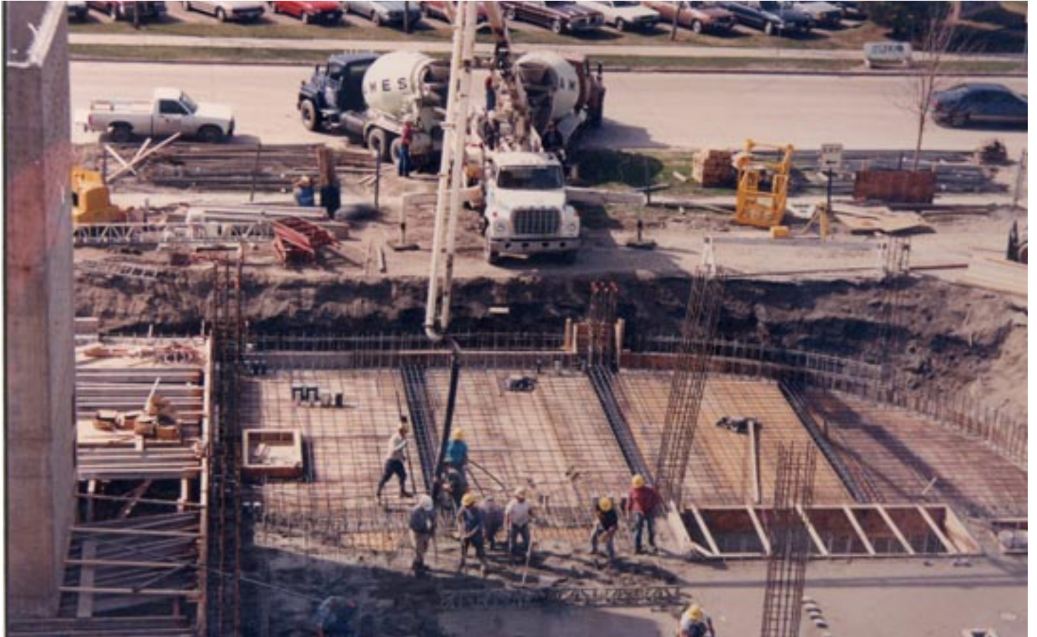
Constructing an addition to Dakota Hospital, Fargo, 1992. Meinecke-Johnson Company and Ames Sand & Gravel, 1992.