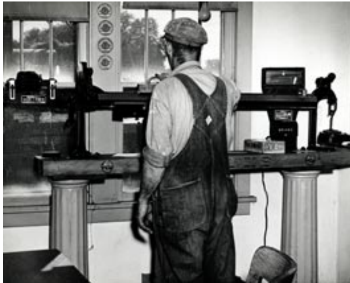
Livestock scale being balanced for accuracy at the West Fargo Union Stockyard, 1950s.