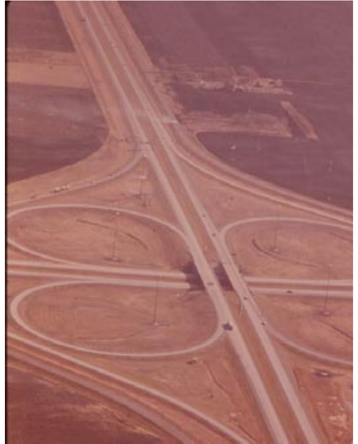
Interchange by West Acres, 1970s.

78% of ND workers drove alone to work in a car, truck or van, 5% walked to work, 10% carpooled. 39