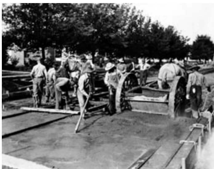
Laying concrete on either side and between street car rails in Moorhead, MN, 1920s.