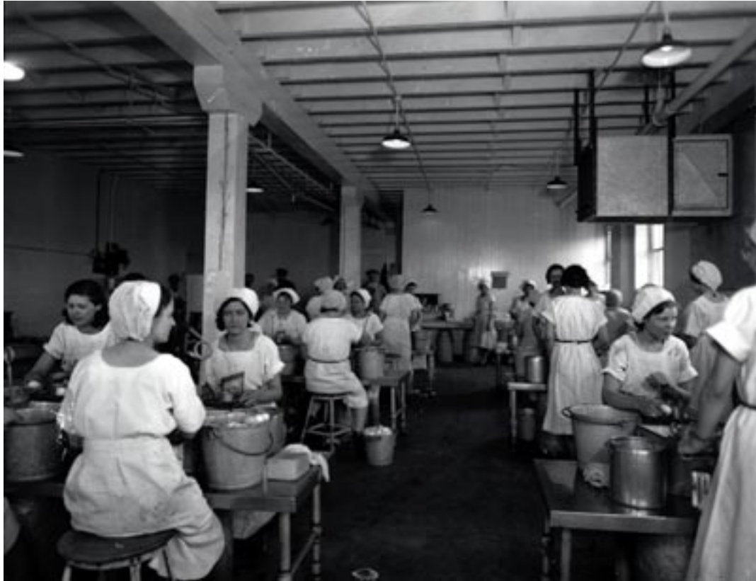
Egg factory probably in Fargo in the 1930s.