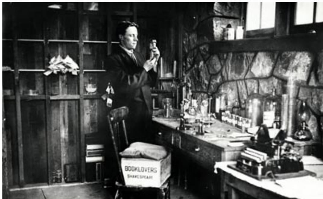
Forerunner of the present-day research scientist, 1910-1919.