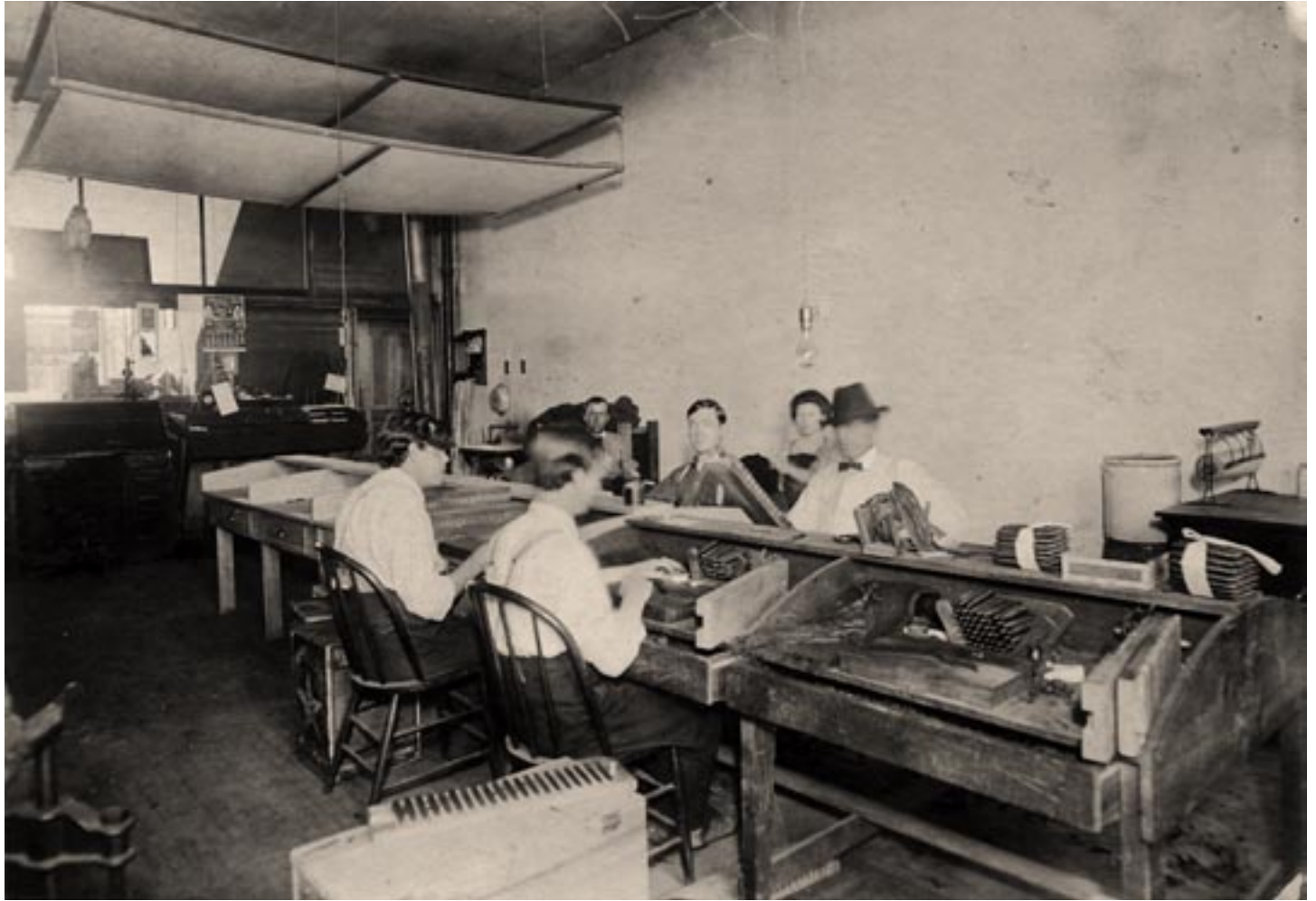
Manufacturing cigars in the Sulzbach factory in Fargo, about 1907.