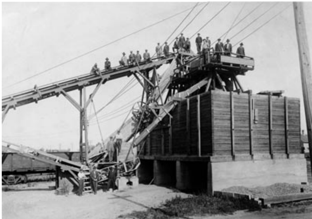
Students from North Dakota Agricultural College and employees from Fargo Stone and Sand Company standing on a conveyor belt and platform above a gravel sorter, 1918.