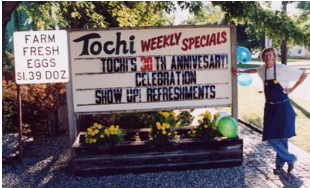
Will Hoglund in front of Tochi Products during 30th anniversary celebration, 2001. (Louis Hoglund)