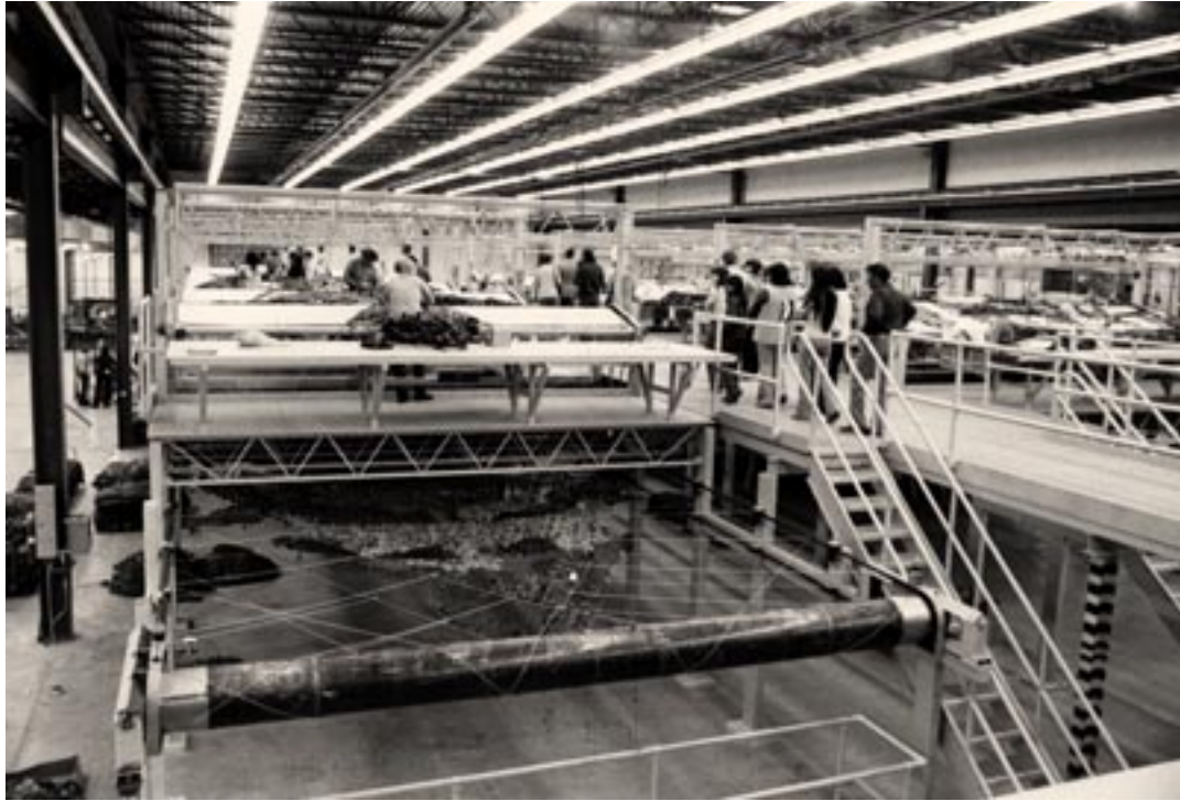
Sioux Manufacturing plant, Devils Lake, ND, 1970s. Workers are making camouflage covers.