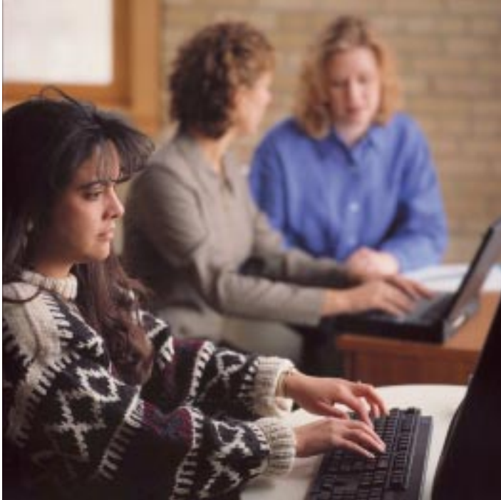
Using the personal computer to expand business, 2002.