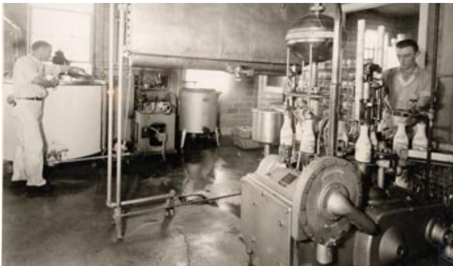
Original milk bottling machine at Cass-Clay Creamery, Moorhead, MN. Cass-Clay opened its doors in Moorhead with seven employees and one truck in 1935.