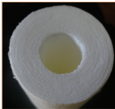
D. Close-up of a spun-polypropylene filter.

Sediment filters typically look like woven string (A), spun polypropylene (C and close-up D) or pleated paper (B) and are selected based on the particle size removed (for example, 2 microns to 100 microns). A small particle size (2- to 5-micron) filter has smaller pores and thus requires more pressure to push the water through the filtering material.