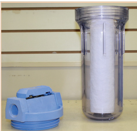
C. Clear whole-house filter housing allows you to see when filter is plugged.