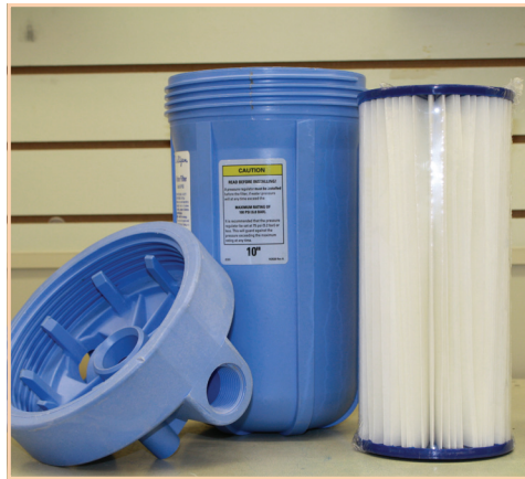
B. Whole-house filter housing with a pleated filter.