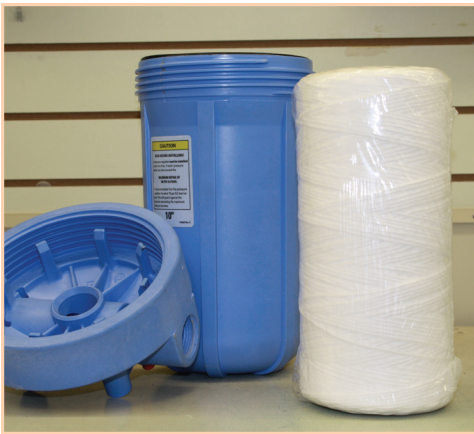
A. Whole-house filter housing with woven-string filter.