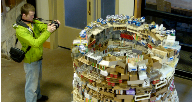
A student photographs the tower built by architecture students, which will be on display in the Renaissance Hall lobby until April 15.

Fifty-five beginning architecture students made 1,000 bricks out of a variety of materials for their structure class. Not comprised of traditional clay, the bricks are made of everything from layers of carpet to aluminum foil to shotgun shells. The bricks bare only one similarity, the dimensions of a standard brick – eight inches by four inches by two and a quarter inches. The bricks are stacked into a tower that will be on display in the Renaissance Hall lobby until April 15.