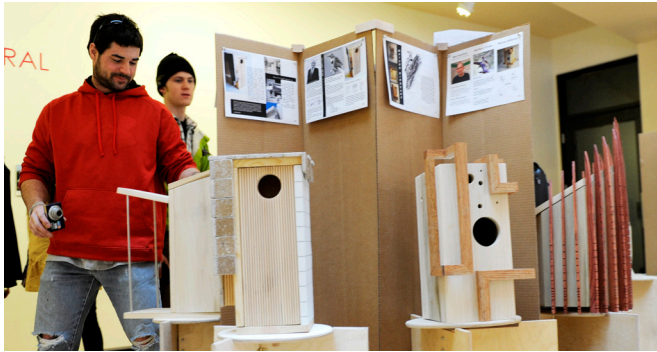
Second-year architecture students displayed their birdhouse designs at the Plains Art Museum March 5-11.

Second-year architecture students at NDSU participated in the second annual design and construction competition, “For the Birds.” The students were asked to design a birdhouse for a particular type of bird, bat or owl, through interpretation of a particular architect’s design philosophy. The projects were featured at the Plains Art Museum in downtown Fargo from March 5-11 and are now displayed on the fifth floor of Renaissance Hall until March 25.