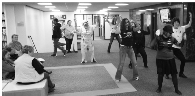
In celebration of Halloween, members of the NDSU Library staff treated students and staff to a dance performance set to "Thriller" by Michael Jackson.

Presenter Support grants are designed to benefit nonprofit organizations that serve communities with populations of less than 6,000 residents through financial support for arts events and programming.