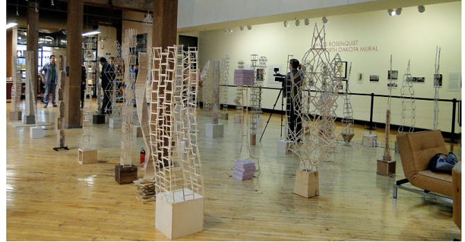
The Popsicle stick towers were displayed at the Plains Art Museum in downtown Fargo until April 12.

Second-year NDSU architecture students may have depleted Fargo's supply of Popsicle sticks for their most recent hands-on project.