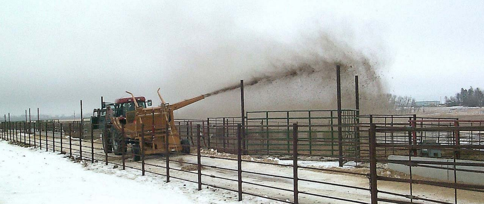
A straw cannon provides bedding for calves from the feed alley.

Bedding may be spread with a loader equipped with a grapple fork or bale shredder, or a “straw cannon” can be used to blow bedding into pens from the feed alley (see photo).