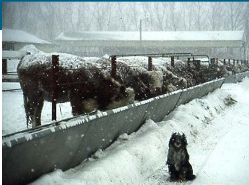
Cattle can thrive regardless of the elements when producers use good husbandry practices.

If at all possible, start cattle on feed before severe weather occurs. If not, provide generous bedding and wind protection in addition to a nutrient-dense diet and aggressive preventive health-care program. The challenge for feedlot operators is to manage their resources to provide the optimum conditions for cattle to thrive regardless of the elements.