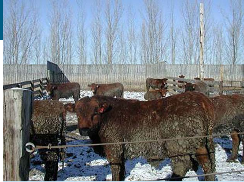
Calves provided with no bedding have less insulation, carry more mud and perform poorly.

Feedlots have some advantages to feeding cattle in the northern Plains states. Summers in the northern Plains are very pleasant. A wide variety of feed grains, coproduct ingredients and forages are available at competitive prices, and rural areas are sparsely settled. Certainly, severe cold and wind can impact performance negatively, but feedlot managers can mitigate these conditions to some extent with proper planning, facility design and good management practices. Fall and spring in the northern Plains can be challenging seasons for feeders because wet, cold conditions negate the natural insulation value of the hair coat and wet, muddy cattle lose heat readily. Bedding is not as effective during cold rain and/or snow.