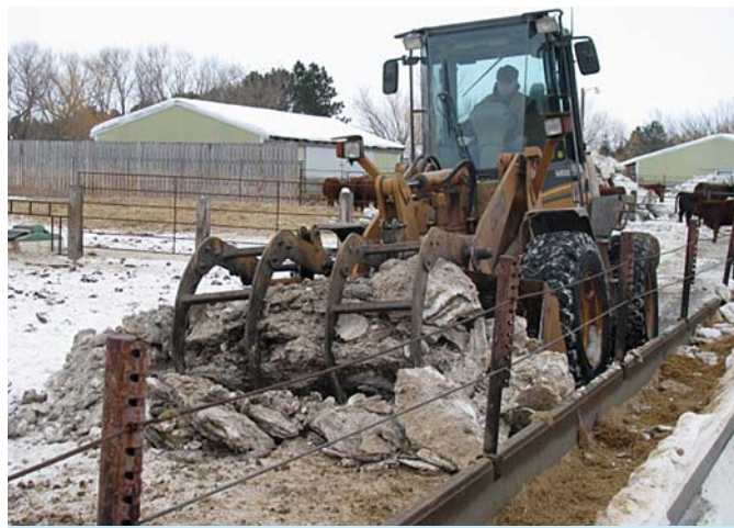
Removing snow and ice buildup provides better footing for the cattle and easier access to feed in the bunk.

Anecdotal experience suggests intermittent bedding of cattle fed 90 to 92 percent concentrate diets can throw cattle off feed and cause bloat. We recommend that cattle be bedded after they have been fed to reduce consumption of bedding.