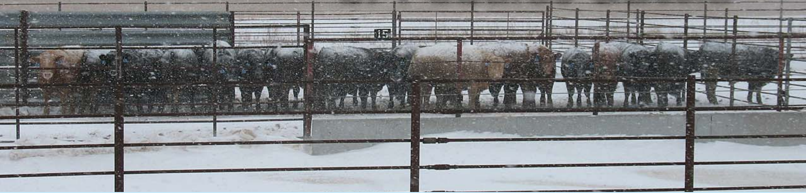
Cattle utilize a guard rail windbreak during a blizzard.