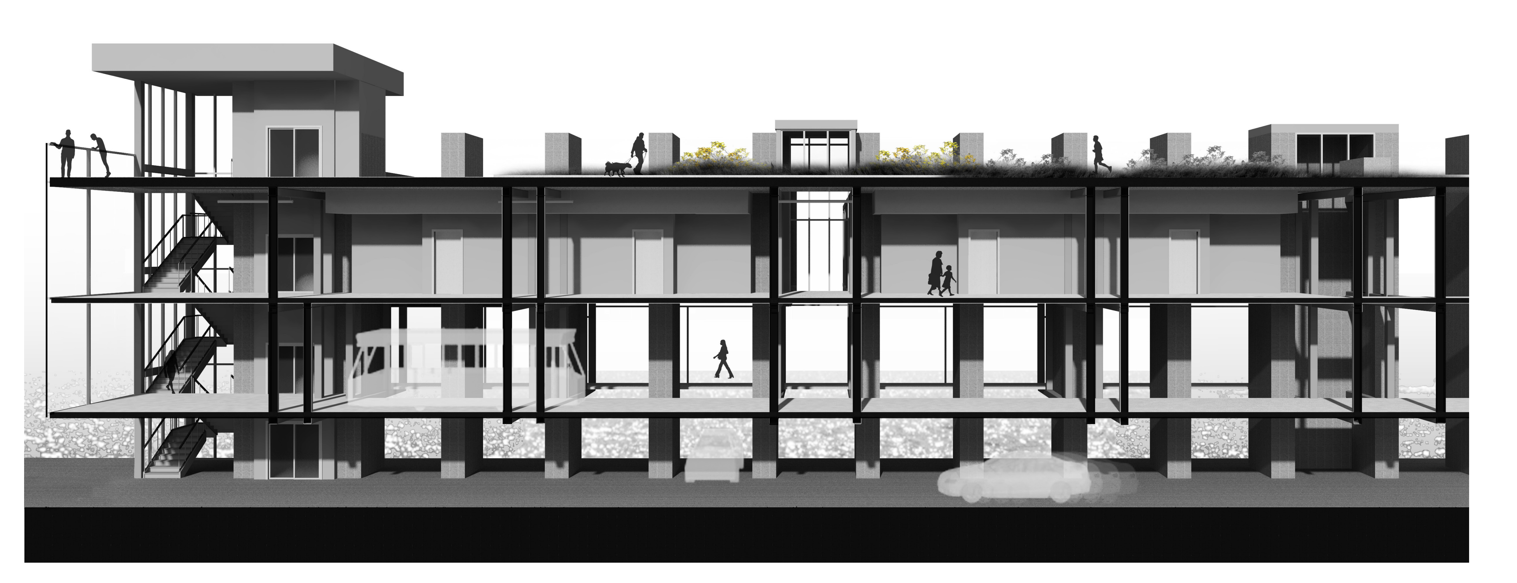
longitudinal section perspective