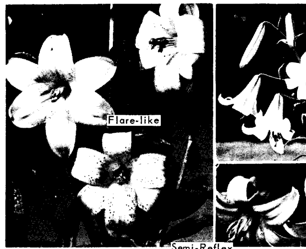
FIG. 1 FORMS OF LILY FLOWERS

Exposure - Nearly all lilies prefer full sun, but the more subtle pink and orchid shades will fade less quickly with a little afternoon shade. Two-thirds day of sun will be necessary to produce strong bulbs for next year.