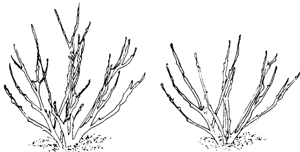
Figure 1. Pruning currants, before and after.

Gooseberries are usually pruned more severely than currants. Fewer canes are left and the remain-