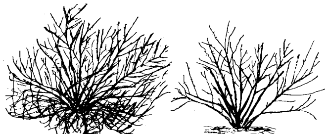
Figure 2. Pruning gooseberries, before and after.