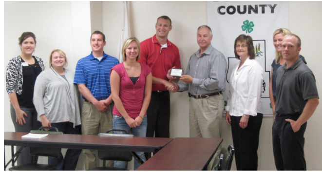
Extension staff accept a Top 10 Young Professional Workplaces award from members of Bismarck-Mandan's Young Professional Network.

Bismarck-Mandan's Young Professionals Network has named the NDSU Extension Service as one of the top 10 workplaces for young professionals.