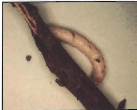
Figure 3. Leafy spurge flea beetle adults feed on the foliage (top), but the real damage to the plants is from larvae feeding on the root system (bottom).

with herbicides. Herbicides should not be applied directly over the insects in early summer since this would remove the food source for adult beetles. Once established the insects should be redistributed by the land manager, as flea beetle movement to other infested areas is slow.