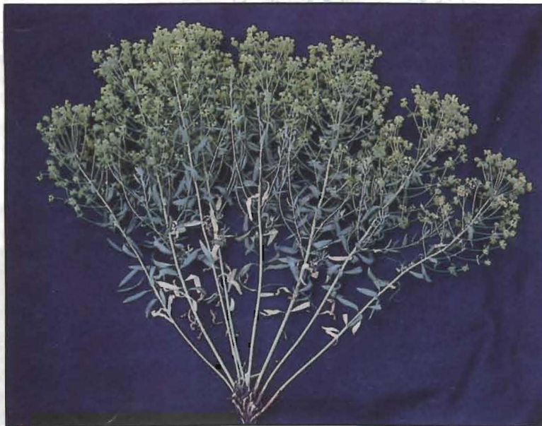
Figure 1. Leafy spurge plant in flowering growth stage.

as near water, where herbicide use is restricted. Non-herbicide control options such as biological and cultural methods can provide good but not complete leafy spurge control. An integrated control program combining two or more methods will provide a more successful and cost-effective long-term solution to the leafy spurge problem than a single method used alone.