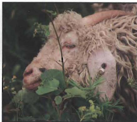
Figure 5. Angora goats will graze leafy spurge and shrubs with minimal grazing of grass species if properly stocked.

Recommended stocking rates vary with terrain, leafy spurge density, and rainfall during the growing season. Sheep should be grazed at approximately three to six head per acre of leafy spurge per month or one to two ewes per acre of leafy spurge for the summer. NDSU research using Angora goats found that 12 to 16 goats per acre of leafy spurge per month or three to four goats per acre of leafy spurge for four months (growing season) controlled leafy spurge with little utilization of the grass species (Figure 5). The stocking rate will decline over time as the leafy spurge infestation is reduced. Prevention of flowering and seed-set by leafy spurge is important. Before moving animals to a leafy spurge free area, they should be contained for three to five days so viable seed can pass through the digestive system.