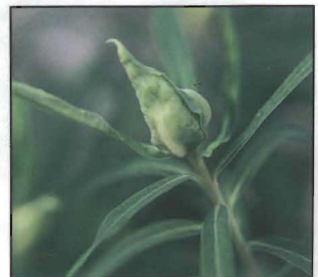
Figure 4. Leafy spurge stem tip galled by Spurgesa esulae larvae which prevents seed set.

The integrated program may be most useful near wooded areas or rough terrain. Herbicide treatment would prevent leafy spurge spread outside the tree area or inaccessible site and the gall midge would reduce seed production within the areas where herbicides generally cannot be used.