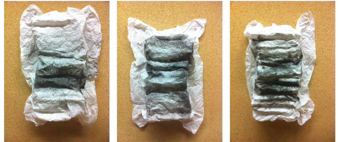
Impression from the cast concrete