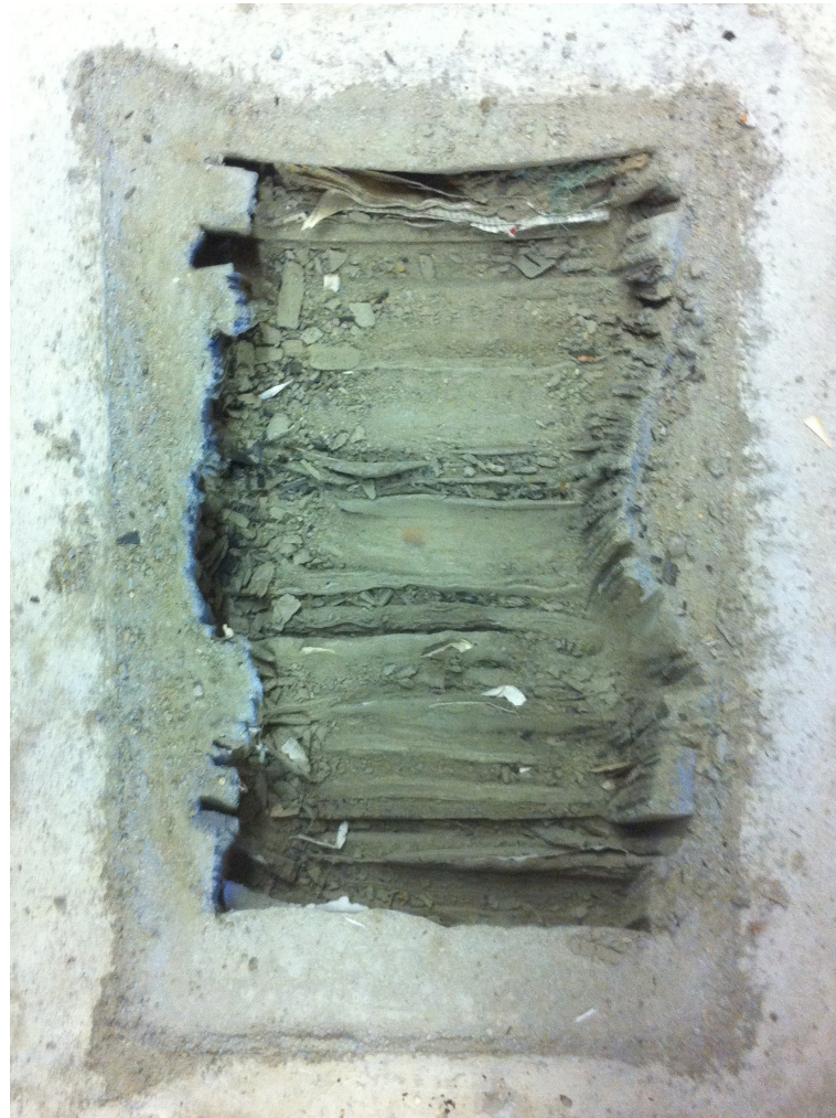
Books cast in concrete