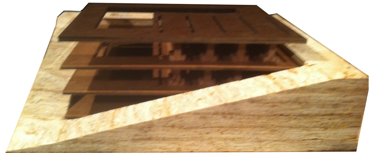
Movement through layers

The traditional functions of the library should act as the foundation for today's libraries. With the world changing at such a rapid pace, libraries are increasingly becoming places of continued education, a place for life-long learning. Ken Worpole says "imaginatively designed and responsive public library services can play a pivotal role in promoting greater social cohesion and a stronger sense of civic pride and local identity".