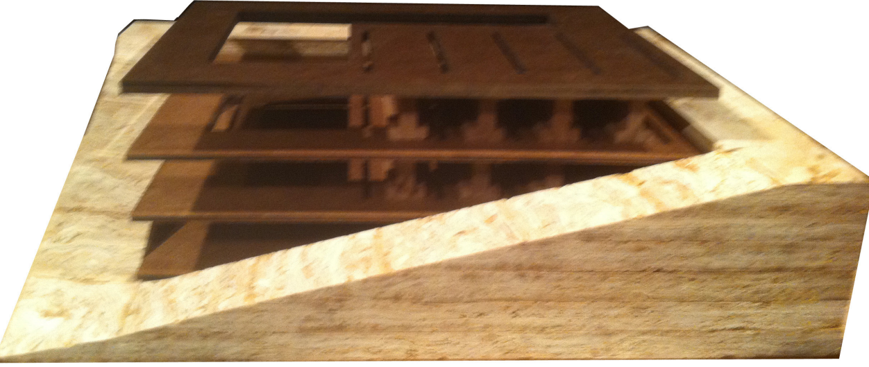
Movement though layers

The traditional functions of the library should act as the foundation for today's libraries. With the world changing at such a rapid pace, libraries are increasingly becoming places of continued education, a place for lifelong learning. Ken Worpole says "imaginatively designed and responsive public library services can play a pivotal role in promoting greater social cohesion and a stronger sense of civic pride and local identity".