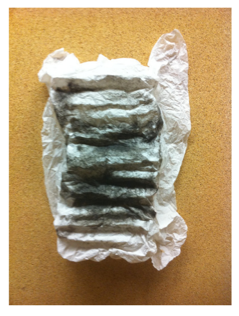
Impression from the cast concrete