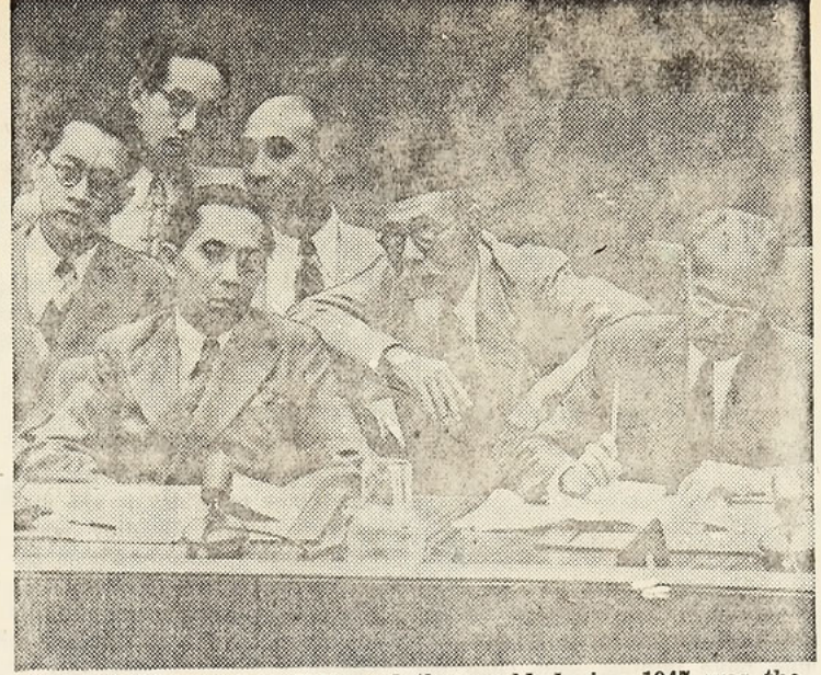
Of major interest to U.N. and the world during 1947 was the demand of this Indonesian delegation that The Netherlands be prevented from reoccupying its East Indian colonies. U.N. appointed a mission to supervise the Dutch-Indonesian armistice.

NDAC agricultural officials said that thousands of acres of vicinity. Future road and street land were treated with 2-4-D and other chemicals the past season. They said that Herbicides and Salaries range from $165 to fungicides were used, some with