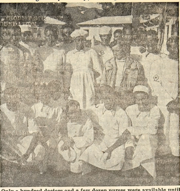
Only a hundred doctors and a few dozen nurses were available until recently to care for Ethiopia's total population of some 12,000,000. Now, with the aid of the U.N. World Health Organization (WHO), training programs in all parts of the country are turning out the necessary help to relieve the critical shortage of medical personnel.