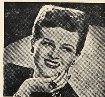
Jo Gets Glow

Purpose of the tour was to acquaint college students with the problems and production methods of California manufacturers and to demonstrate the opportunities for men and women with college training.