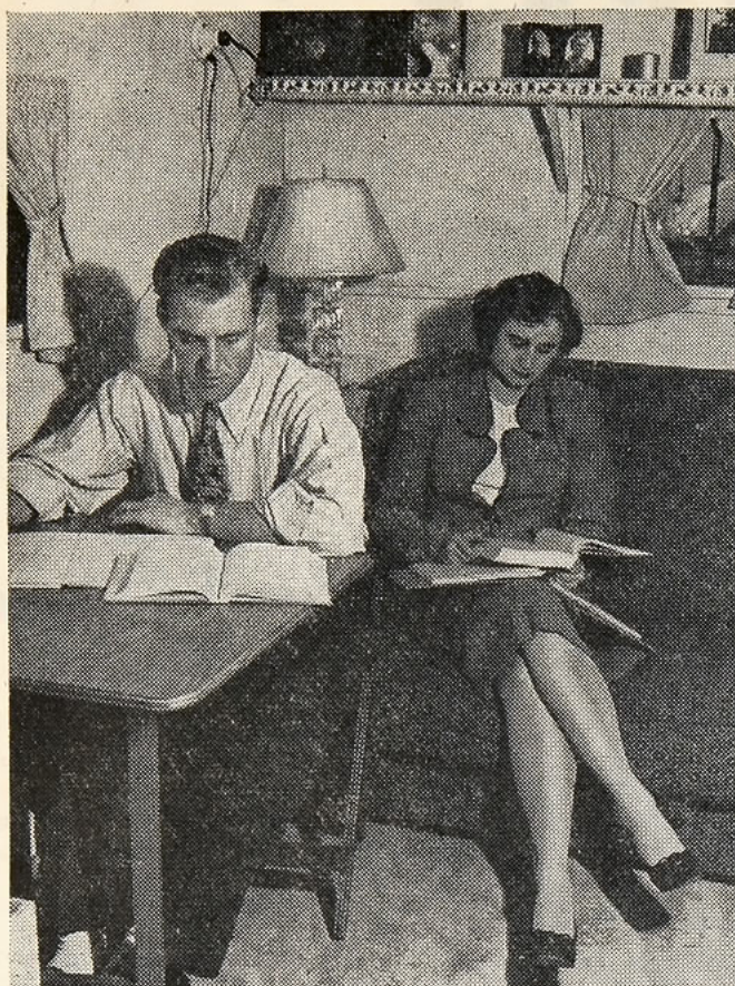
● Study hour at Grinde's