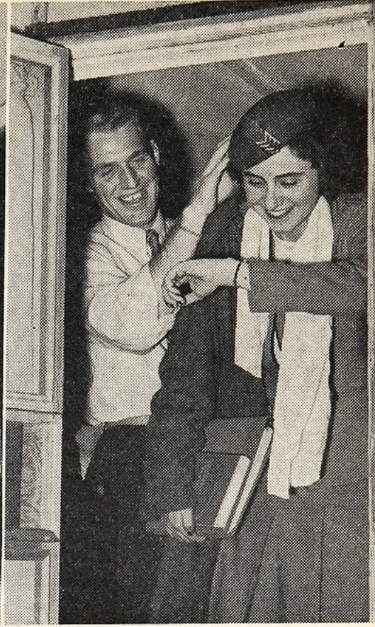
● Dagwood rush-hour at 8 a.m.