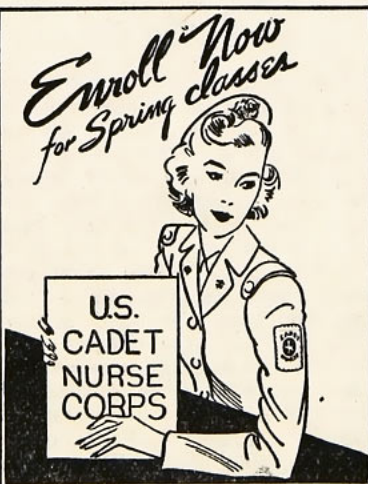
U. S. Public Health Service Federal Security Agency