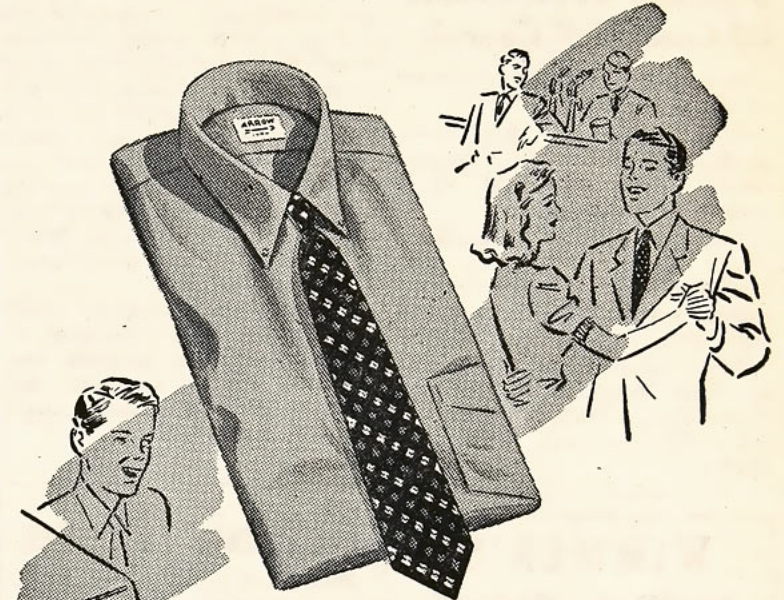
*Big Shirt on Campus

ALWAYS in a top spot in campus popularity polls is Arrow's Gordon Oxford shirt—with regular and button-down collars. Gordon fits you perfectly, because it is cut on the Mitoga form-fit pattern. What's more, it can't shrink more than a microscopic 1%, for it bears the Sanforized label. All for just a slight fee — $2.50.