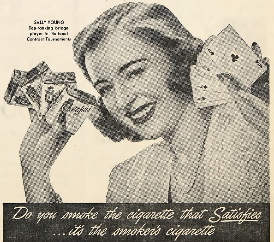
Copyright 1941, Liggett & Myers Tobacco Co.