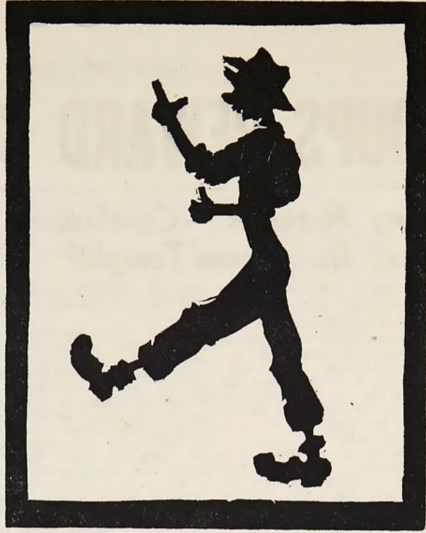
By Maurine Steiner.