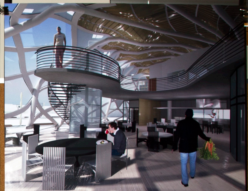
RESTAURANT VIEW LOOKING SOUTHWEST

Urban sprawl has caused lengthy commutes. Vehicles require fuel to run and some of that fuel is made from plants. Land used to grow plants for fuel is taking away valuable space needed to grow food to eat. When there is less food, there is more demand, which raises the price of food. Higher food prices make it difficult for poor people of our world to get proper nutrition. A decrease in food demand can be reached if every city in the world limits their amount of expansion and incorporates more agriculture within the city. This can be achieved by residential outdoor garden plots, community high tunnels, community greenhouses, and roof top gardens.