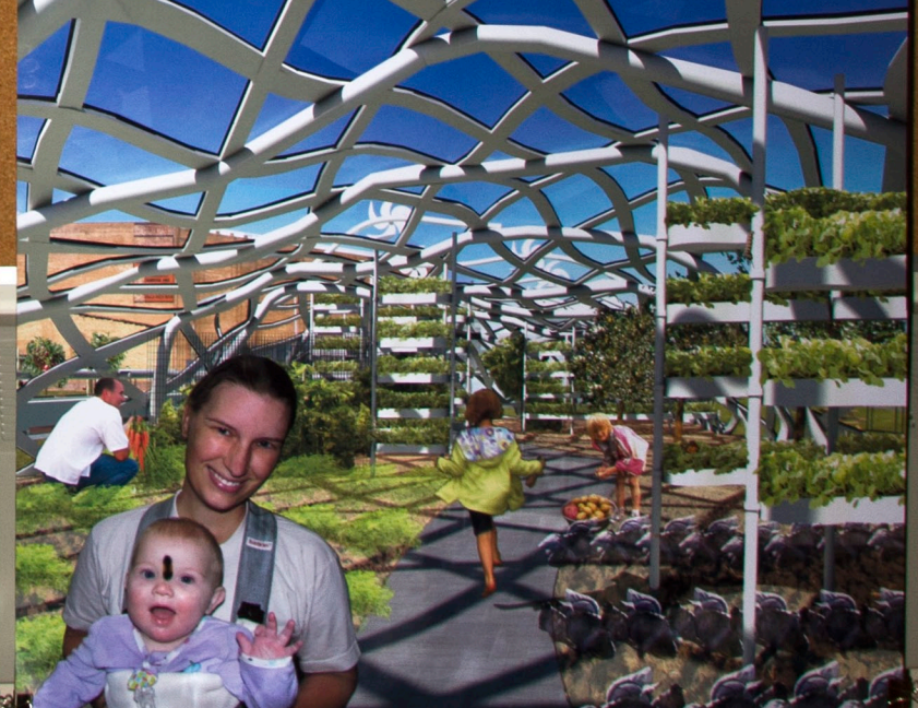
GREENHOUSE VIEW LOOKING SOUTHWEST

My thesis project consists of an urban greenhouse, a restaurant and culinary arts school, and a public park. The greenhouse and restaurant and culinary arts school are located in downtown Fargo, ND, at the Heater Lounge and parking lot, which would be torn down and recycled. The park is located in the empty lot east of the Union Cold Storage building. Visitors can park along the street or in the parking lot north of the greenhouse. One enters the greenhouse from the northeast entrance and picks fruits and vegetables to eat. Another option is to choose a recipe of the on-site cooks' choice and pick the ingredients accordingly. The visitor exits the greenhouse and enters the restaurant. To the left of the entrance there are fresh foods and canned foods stored in large glass display cases, refrigerators, and freezers that the restaurant uses to cook meals. The visitor takes the food up to the counter where a cook teaches how to prepare it. The visitor can take their meal to a nearby table and view the beautiful park scenery or enjoy eating at the counter. The culinary arts school is located on the second level. Students learn new cooking techniques and recipes. The students obtain hands-on experience working in the restaurant kitchen and bakery.