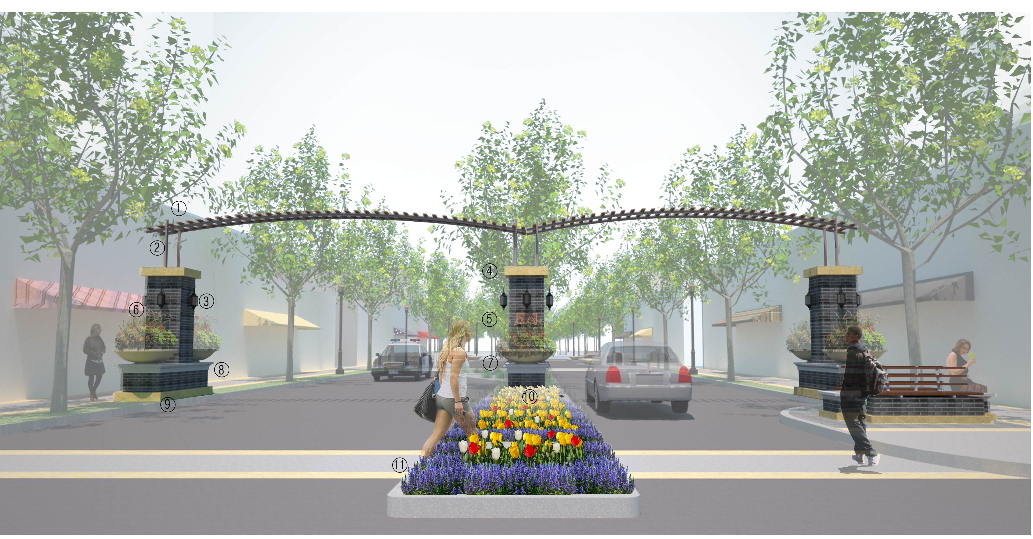
Neighborhood Entrance on Arcade St.