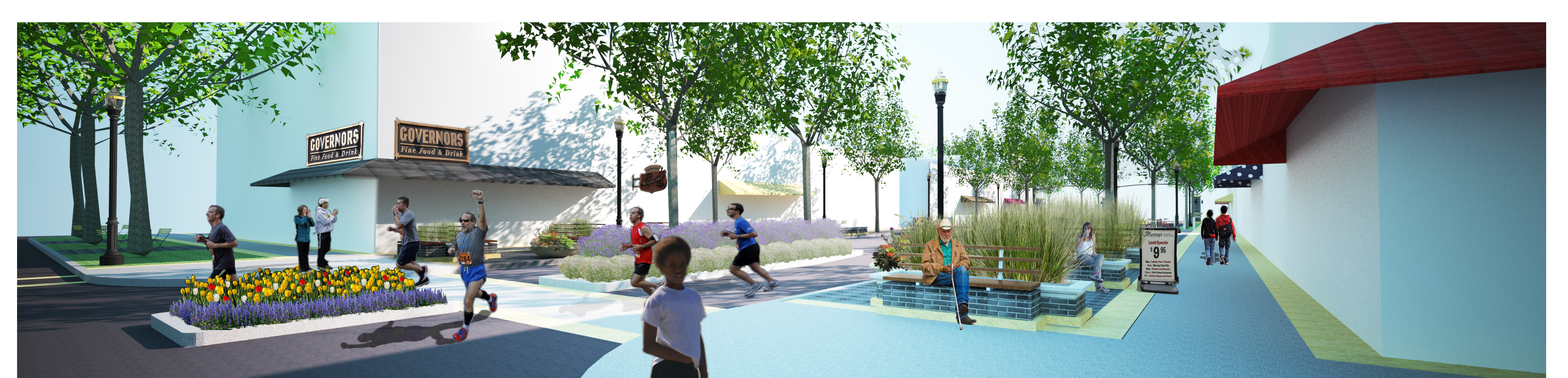
Looking South Standing on the Corner of Arcade and Sims