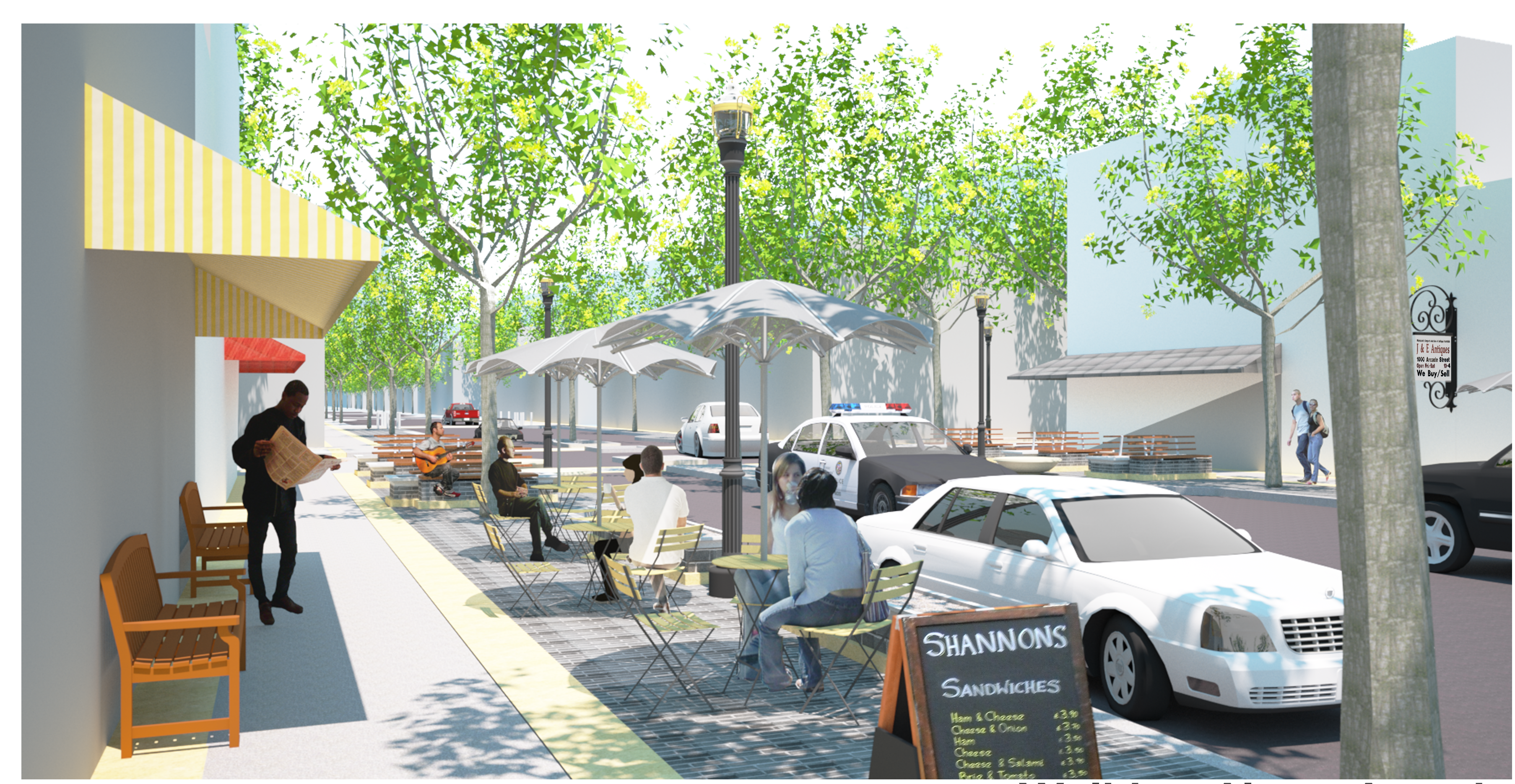
Walking Along Arcade

Seating Area Awning Benches/Planters Seating Area Planters Bike Rack Bollards Mid-block Crossing/Alley On Street Parking Entrance Gate Pedestrian Scale Lighting Automobile Scale Lighting Median Planting