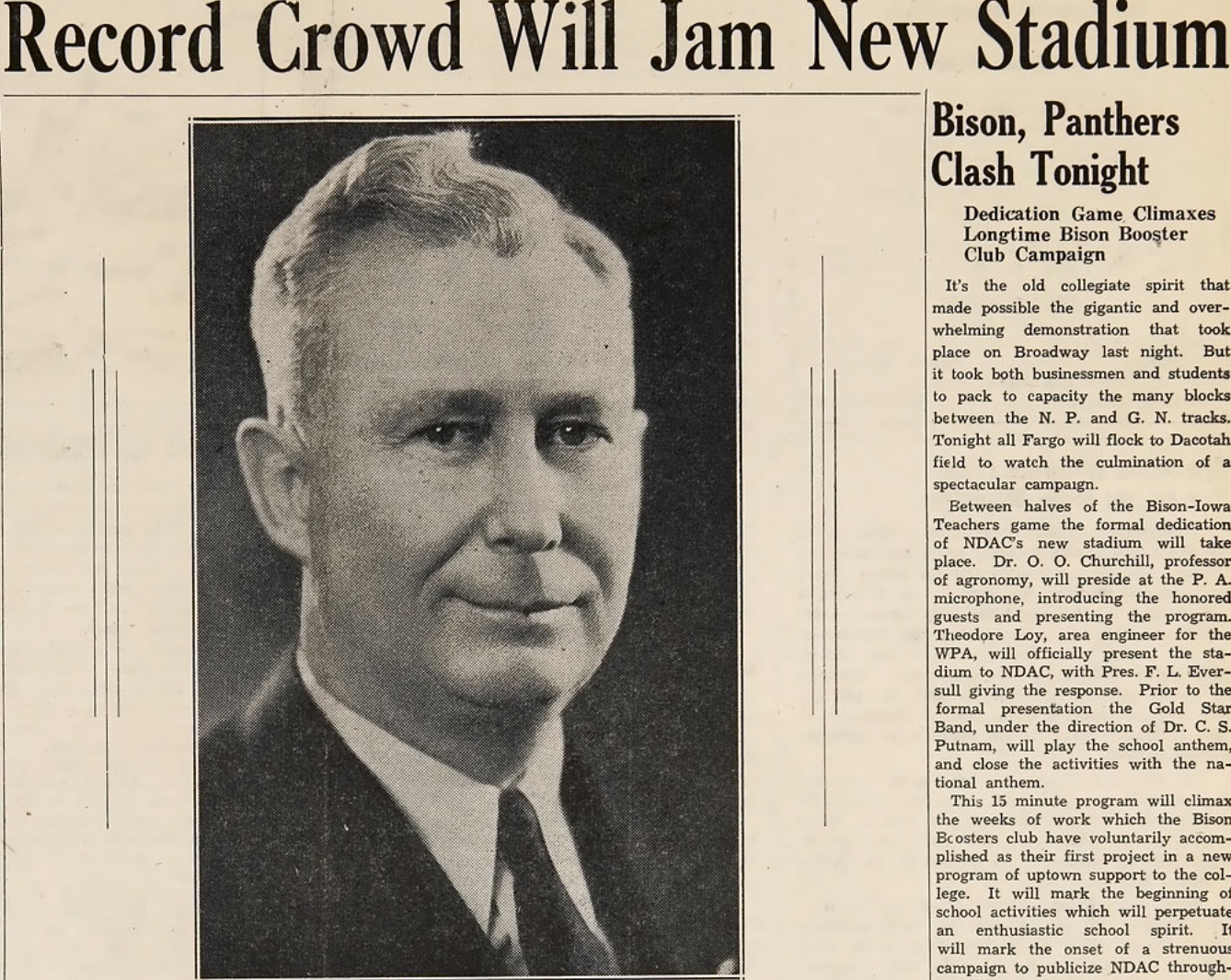
DEDICATED TO YOU

The four section parade included: Police escort, Gold Star band and cadet corps, 1938 Bison football team and the NDAC student body; the American Legion drum and bugle corps, the Bison Booster business men, the high school band and the Bison