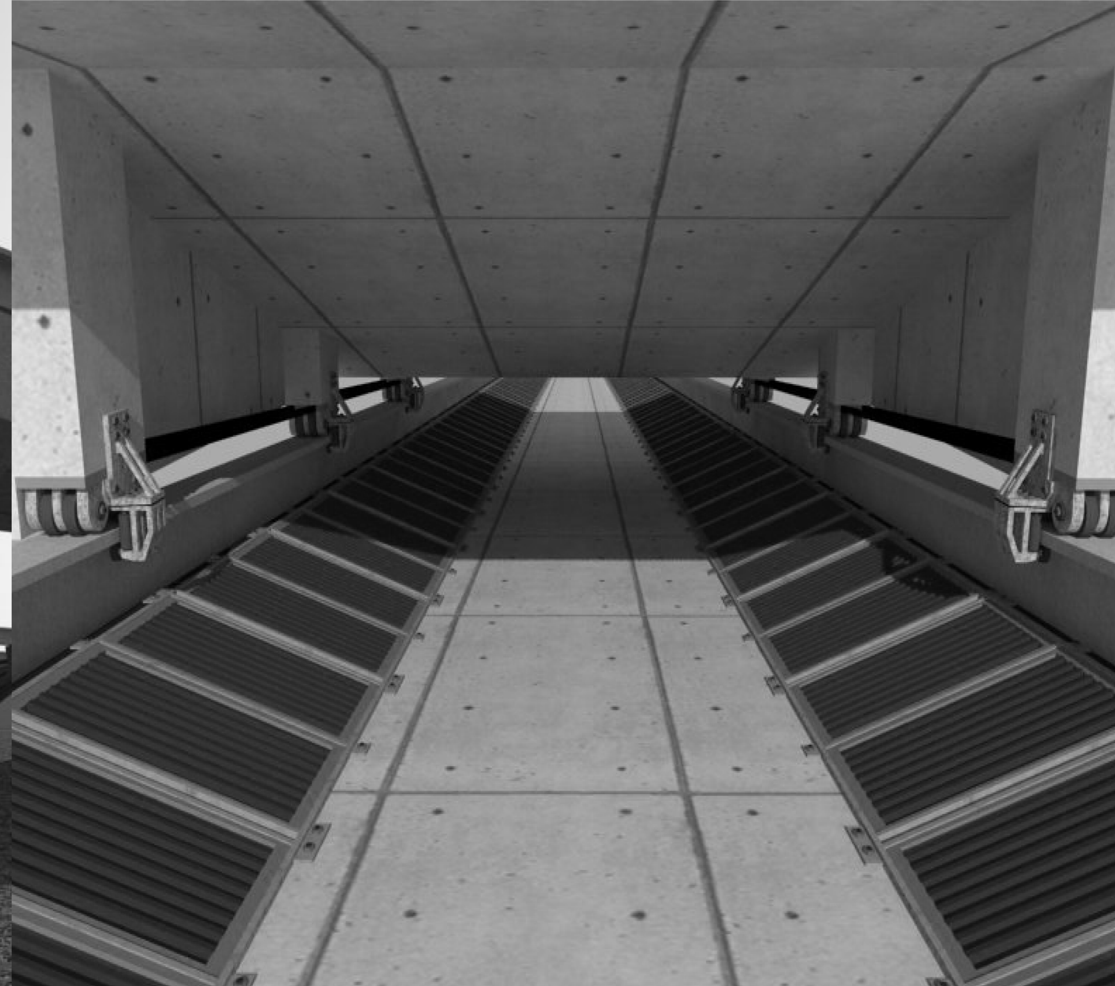
Connection detail of track system to the lower barge section of dwelling.