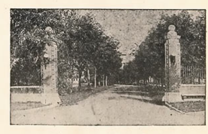
Gateway to College Campus

Through this entrance you pass to the campus of a new world. Beyond the masonry structure lies the North Dakota State College of Agriculture and Mechanic Arts. Here you will find sixteen major buildings that house the mechanical equipment of a college. Here also you will find likable professors and instructors who will be at your service to lead you in your quest for knowledge.