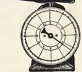
The Shorthand Machine Weighs only 4 1/2 Lbs.