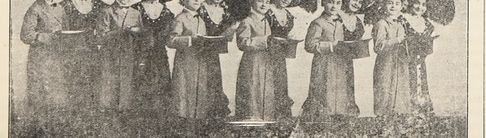
The Pollard Lilliputians in "Fl orodora" and "The Toymaker" Fargo Opera House Wednesday and Thursday Evenings.

as well as the highest ex-nectations. $1.50 up. pectations. $1.50 up. CLUETT, PEABODY & CO.. Makers