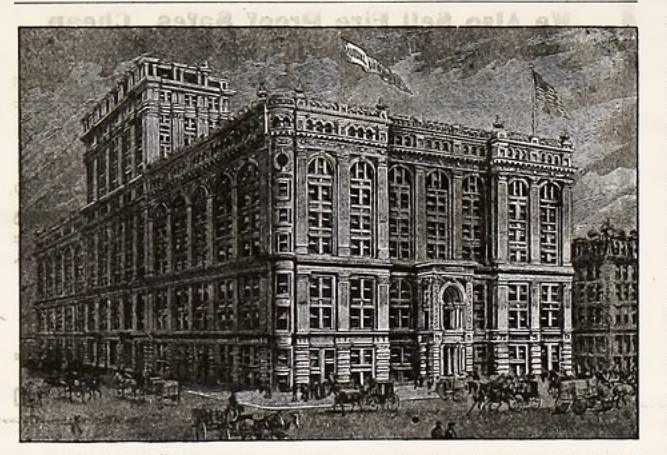
HOME OFFICE OF MUTUAL LIFE INSURACE COMPANY OF NEW YORK, 34 Nassau Street, N. Y.