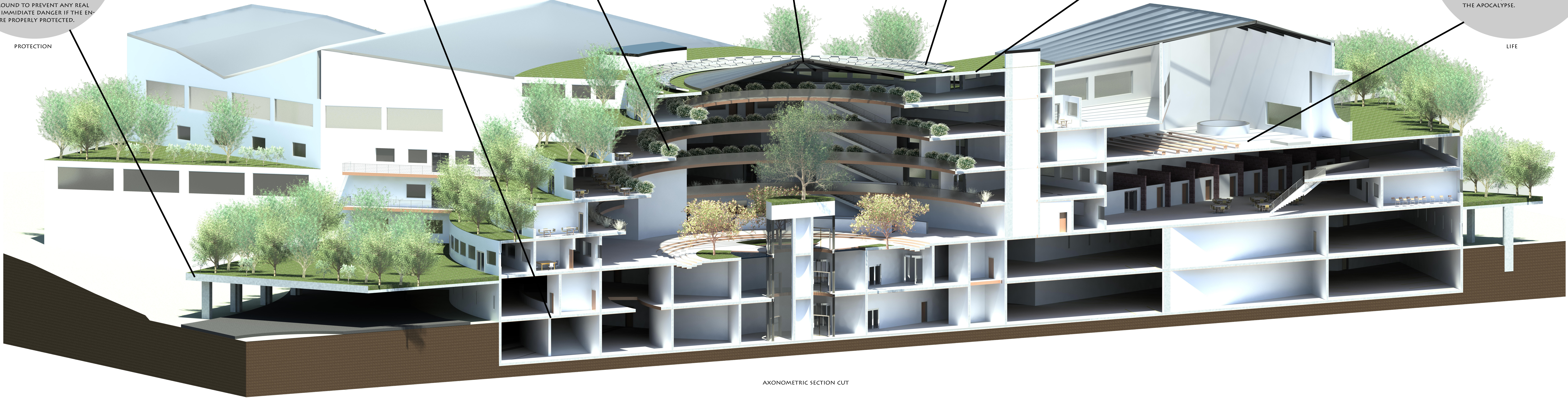
AXONOMETRIC SECTION CUT

THE MAIN FOCUS OF THIS PROJECT IS TO ENSURE A HEALTHY LIFESTYLE AS WELL AS AN ENTERTAINING ONE. THE PROGRAM OF THE COMMUNITY SHELTER PROVIDES EVERY NEED OF THE HUMAN BEING, MENTALLY, PHYSICALLY, EMOTIONALLY, AND EVEN SPIRITUALLY. WHETHER ITS FOOD PRODUCTION TO WORSHIP, OR EXERCISE TO EDUCATION, THIS SHELTER WILL PROVIDE, FOR ANY PERSON, A WAY TO SURVIVE THE APOCALYPSE.