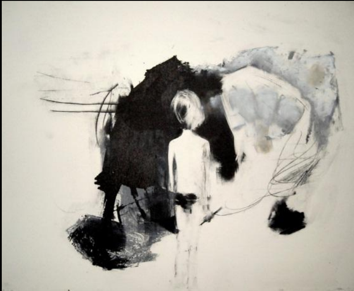
Kivinen, Tiina. "Planner." Printmaking. Tiina Kivinen. 12 Nov. 2008. Web. 20 Nov. 2012.