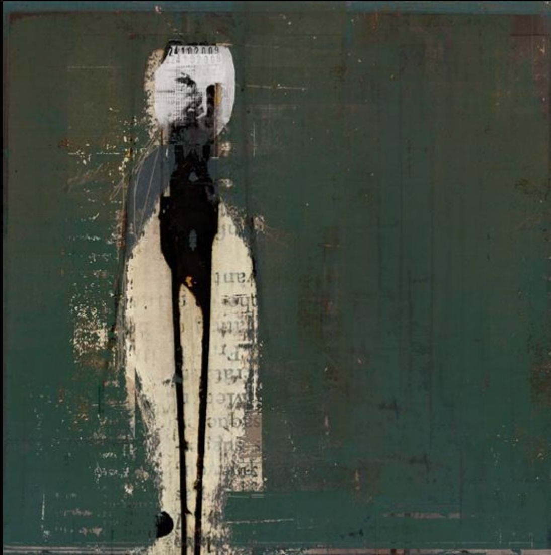
les brumes. "081508300430." Collage on Canvas. Flickr. 3 Apr. 2012. Web. 27 Nov. 2012.