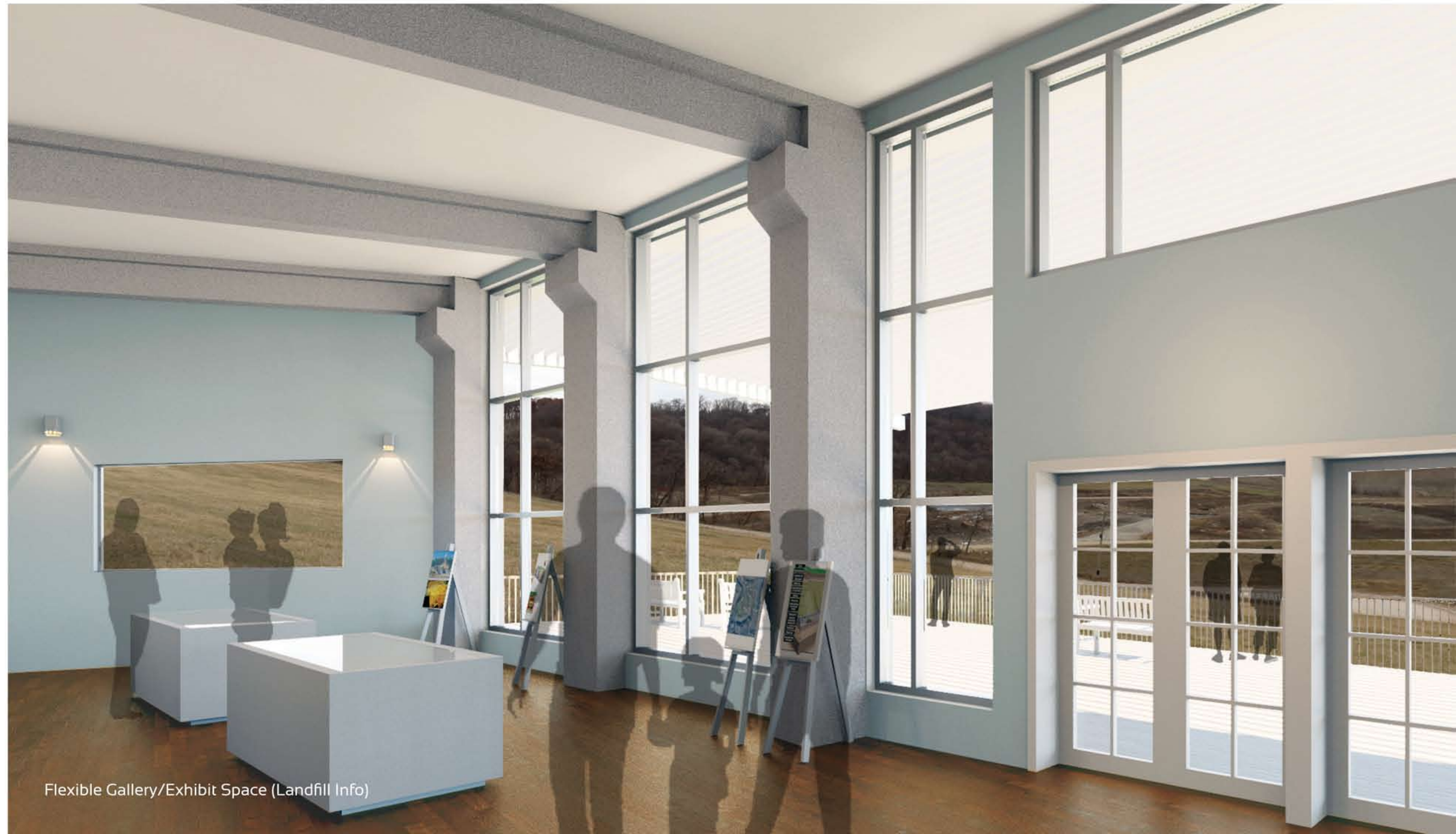
Flexible Gallery/Exhibit Space (Landfill Info)