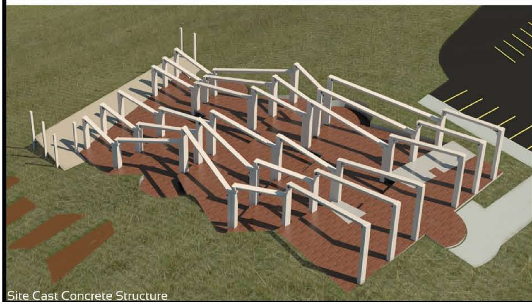
Site Cast Concrete Structure