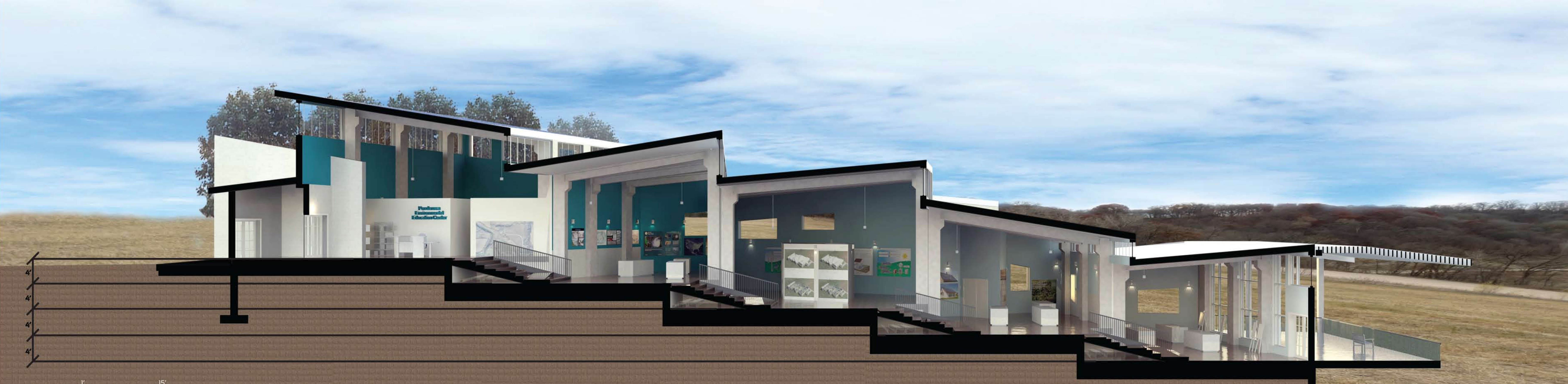
Section B 1" = 5' 15'

Department of Architecture and Landscape Architecture, NDSU ARCH 772, Design Thesis, Spring 2013 Architecture's Impact, Environmental Education Facility, 16,174 sq. ft. Kelly Fichtner Ganapathy Mahalingam Revit, Photoshop, Illustrator