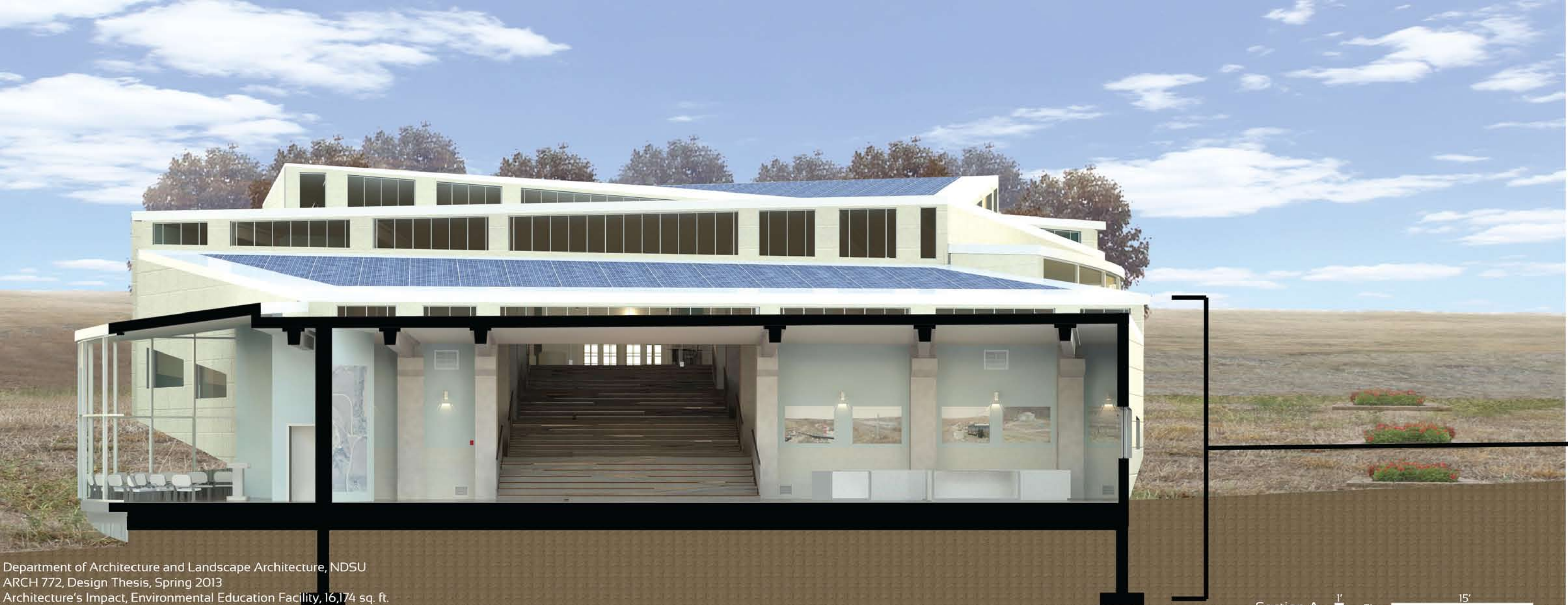
Section A 1" = 5' 15'