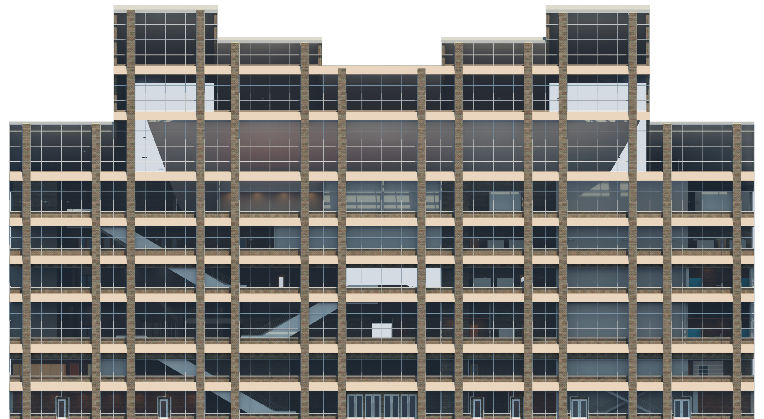
North and South Elevation