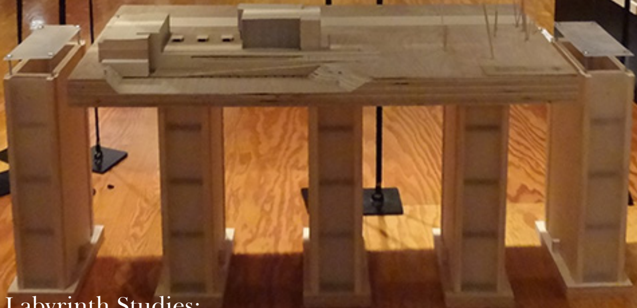
The Labyrinth Studies: Exhibiting Culture Through Art & Architecture