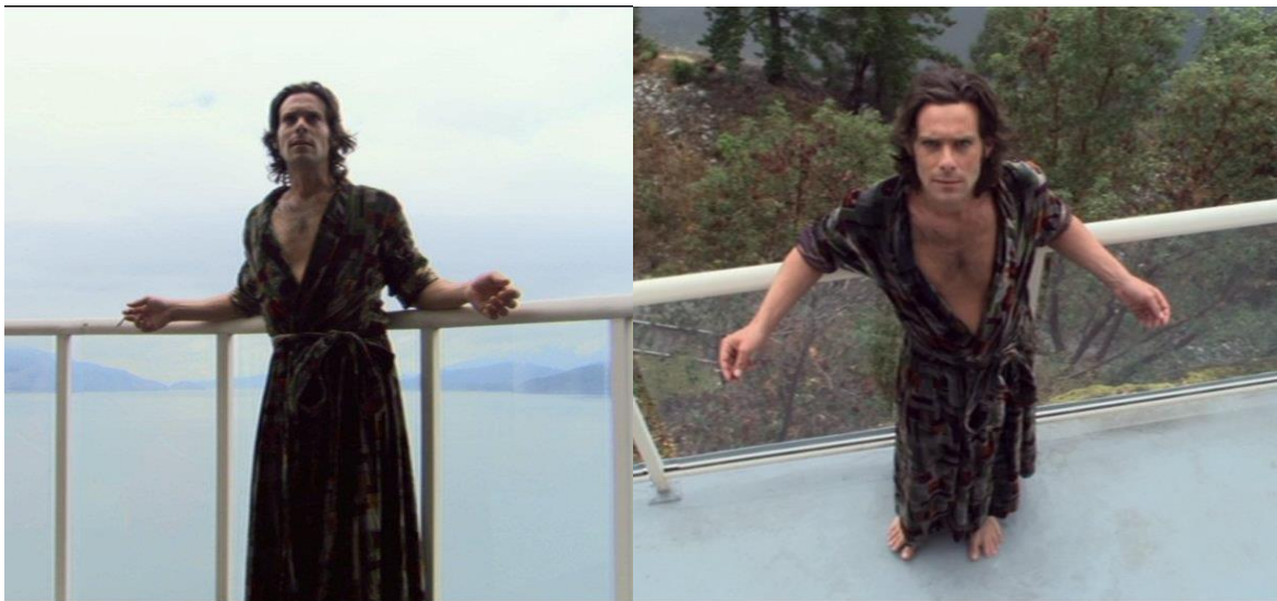
Figure 4. Gaius Baltar, the divine instrument (Weddle and Thompson, "Hand of God").

This realization and future destiny are emphasized in the visual rhetoric of the final shots of this episode (figure 4). Nearly silhouetted against a blue-grey sky, he leans against a railing with his arms lazily extended in a crucifixion pose, foreshadowing his eventual 'crucifixion' before his people in season three and his development into a monotheistic preacher in season four. The loosely-tied robe lends a further Biblical quality to the scene and visually connects Baltar with traditional images of Jesus. The final shot features Baltar looking up into a camera positioned above him, as if confirming his status as divine instrument and looking for further guidance. Camera placement also lets the audience look 'through God's eyes' at him, to see him finally willing to do God's work.