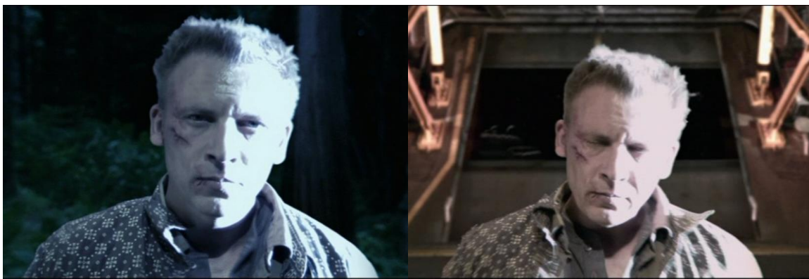
Figure 2. Left to right , Roslin’s vision of Leoben and her reality (Graphia, “Flesh and Bone”).

“Flesh and Bone” 32 opens with the first of Roslin’s visions, where she is chased by Galactica marines through a forest, then encounters the Cylon model called Leoben just before he is pulled away by an unseen force. A short while later, a Leoben is found hiding in the fleet, interrogated and flushed out the airlock (on Roslin’s orders). The cinematic editing takes special care to reuse the exact same shots between Roslin’s vision and Leoben’s death (figure 2), emphasizing the prescient similarity between the two events.