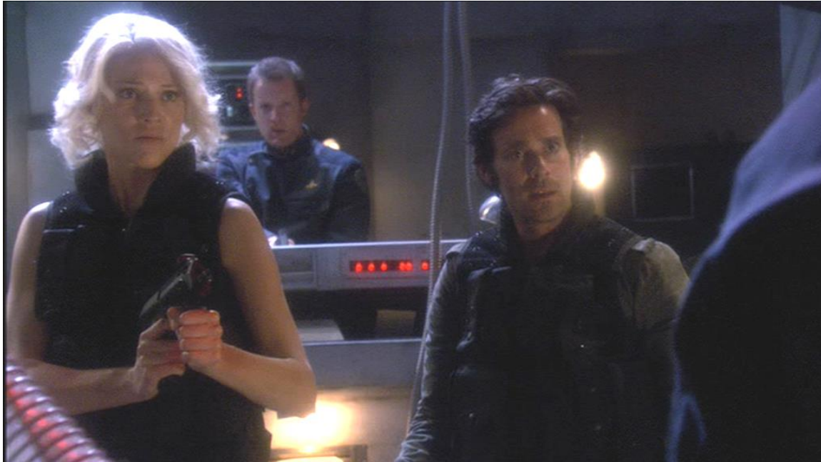
Figure 8. Baltar preaches at gunpoint (Moore, “Daybreak”).