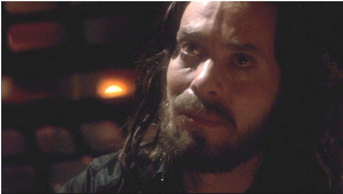
Figure 6. Baltar prays for a miracle (Weddle and Thompson, “He That Believeth in Me”).