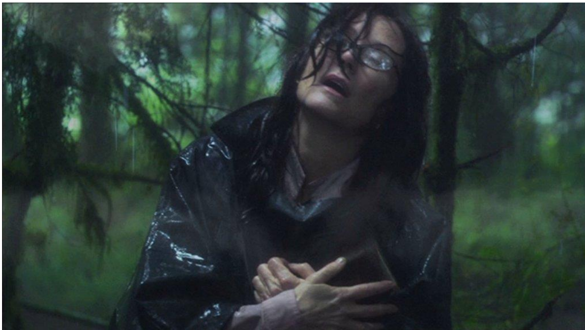
Figure 3. Roslin becomes Moses on Kobol (Moore and Eick, “Home, Pt. 2”).

Pt. 2” reflects this. The opening montage has no dialogue, only images of Roslin leading her troops over the rough terrain in an endless downpour, her hands clutching Elosha’s copy of the scriptures against her heart (figure 3). She moves because she is compelled to and others either get caught up in that fervor and follow her, or they get out of her way. Even Adama, her strongest ‘opponent’ in this search on Kobol, eventually conforms to her will and joins the expedition.