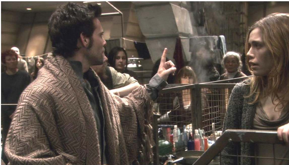
Figure 7. Baltar’s sermon in Dogsville (Espenson, “Deadlock”).

This inner motivation is part of his final drive towards messiahship, a development underscored by the scene itself. This message and teaching is delivered outside of the safety of his lair, in the middle of a large throng of people, similar to how Jesus preached in the public squares at the drop of a hat. Baltar’s message here is clearly not premeditated; it is inspired by the moment and by an immediate need of the people, not just his people. This Christ-like connection is enhanced by the shawl Baltar wears (figure 7) and adds a further “Biblical flavor” to the visuals, as Moore mentions in the episode commentary.