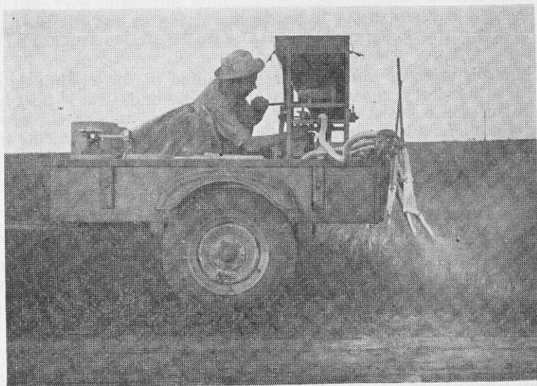
Figure 1.—The insecticides were applied with a power duster mounted on a two-wheeled trailer.

The purpose of this experiment was to determine further the possible role of insecticides, which, if effective, would not be prohibitive in cost, in the control of the wheat stem sawfly. Five insecticidal dusts were applied to plots on each of five fields of hard spring wheat located near Minot, North Dakota. An additional formulation containing 5 per cent DDD was applied in one of the