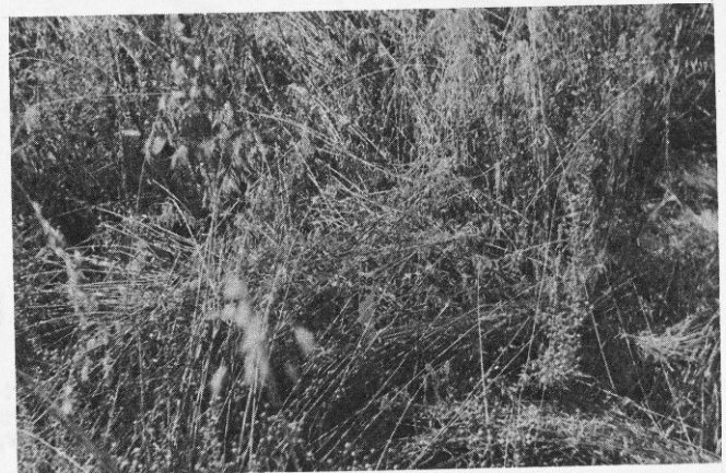
Heavy infestation of wild oats in a field of flax.

Wild oats can be controlled chemically in wheat and barley at a cost of $3.50 and $4.38 per acre, respectively, for the recommended rates of triallate (Far-go). The cost of chemical control in flax is $5.35 per acre for the recommended rate of diallate (Avadex). Barban (Carbyne) at a rate of 4 to 6 ounces per acre may be used in all three crops at a cost of $3.12 to $4.70 per acre. According to the data in Table 1, chemical control of wild oats would be profitable if more than 10, 40 or 70 wild oats seedlings per square yard were present in fields of flax, wheat, or barley, respectively. One also should remember that these data are based on the cost of one year's crop loss. When the cost of future wild oats infestations is considered, chemical control of even smaller wild oats infestations would be economically feasible.