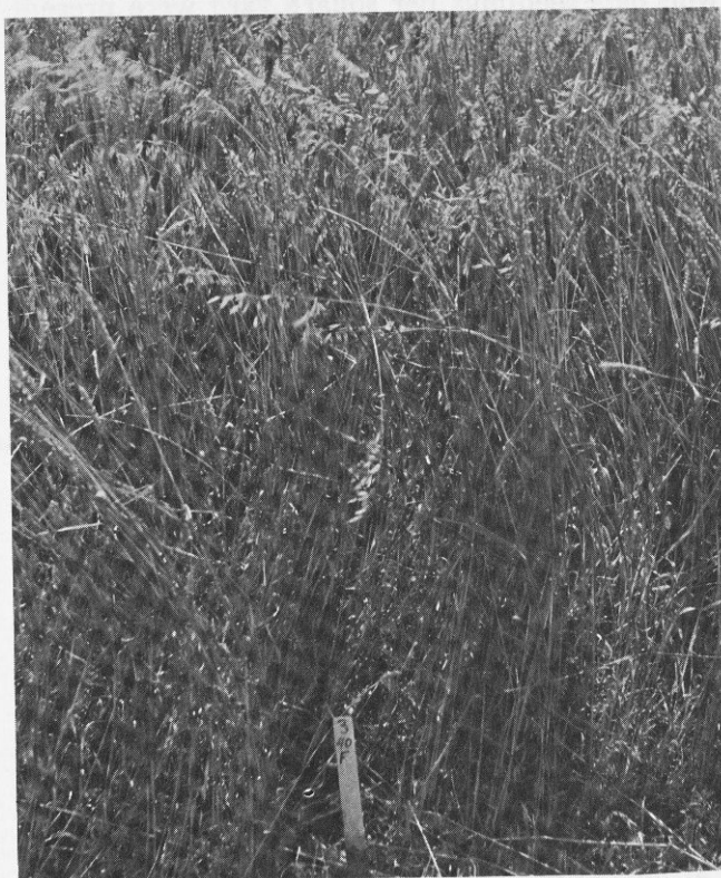
Light infestation of wild oats in a field of wheat.