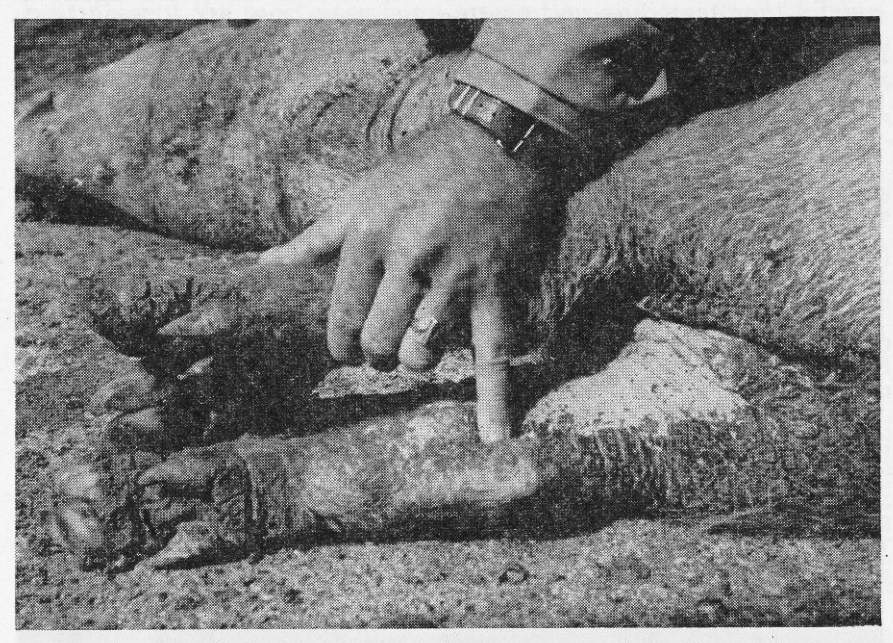
FIGURE 1.—This animal shows the symptoms of parakeratosis. Note the crusty, rough and scabby skin around the hoof, inner legs and under line.

The first sign of this condition is the presence of reddened areas (dermatitis) behind and at the base of the ears, on the inner side of the legs and along the abdomen. The skin becomes thickened,