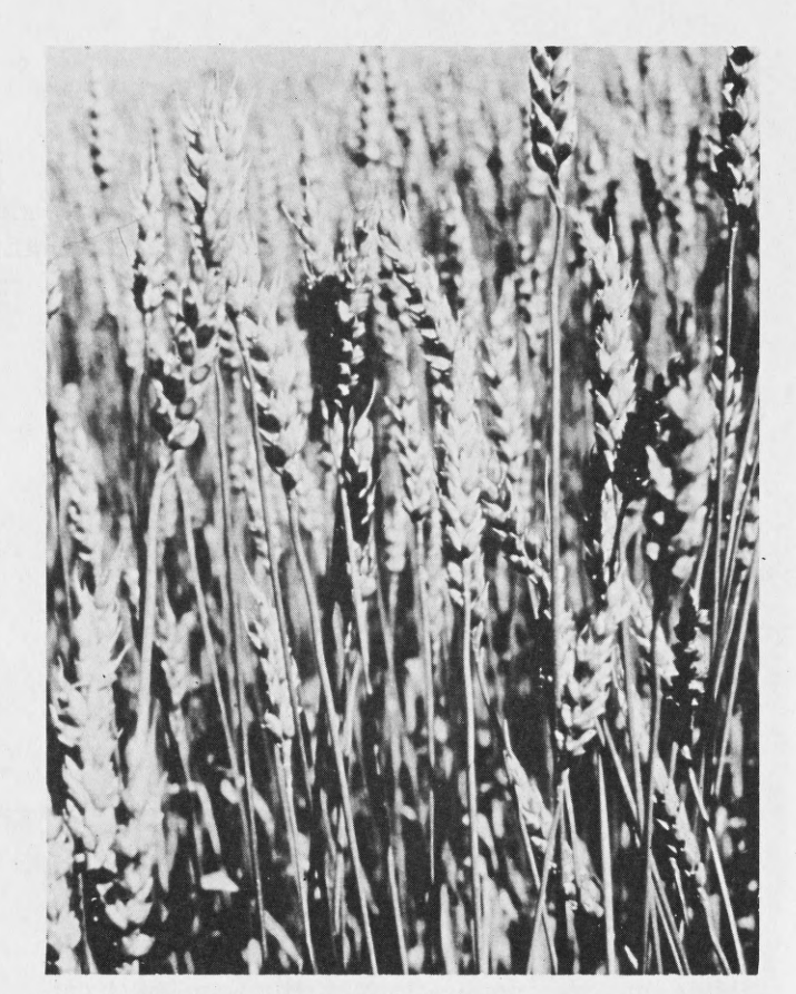
Fig. 1. Heads showing ergotized grain.

This article first appeared in the February 29, 1972 issue of The Southwestern Miller.