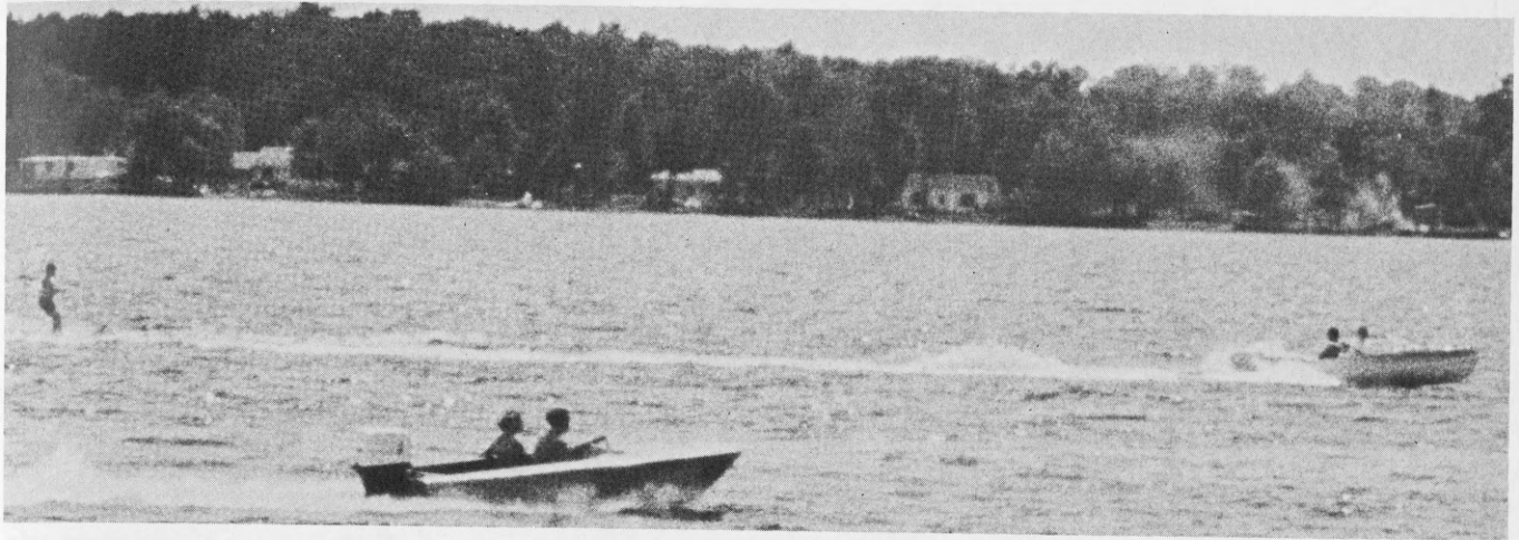
Boating lakes with adequate docks, boat launches and parking facilities provide hours of enjoyment for North Dakota's water-skiing youth.