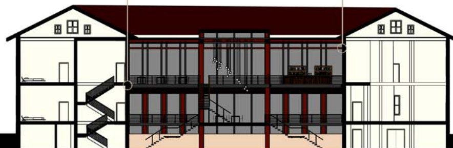
SECTION CUT A // REFER TO PLAN DRAWINGS