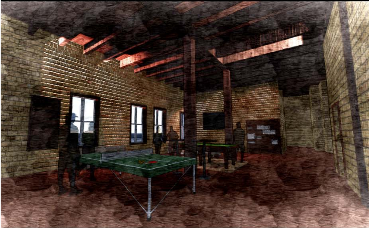
MAIN LOBBY // 1ST LEVEL SOUTH SIDE MAIN GATHERING SPACE, PROVIDES POSTAL SERVICES, CITY & TRANSPORTATION INFORMATION, BIKE RENTAL

RECREATION ROOM // 2ND LEVEL SOUTH SIDE INCLUDES FOOTBALL, BILLIARDS, TABLE TENNIS, LOUNGE SPACE, CARD TABLES