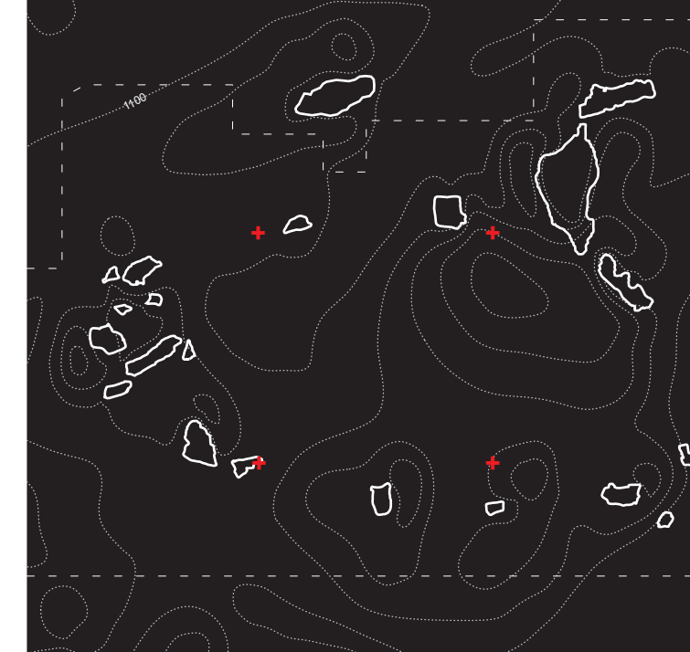
ROCK OUTCROPS & GEOLOGICAL FEATURES