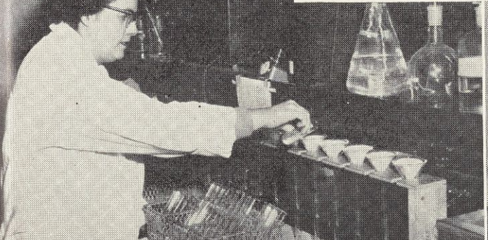
Mastitis tests on milk to detect affected cows are being evaluated at NDAC.