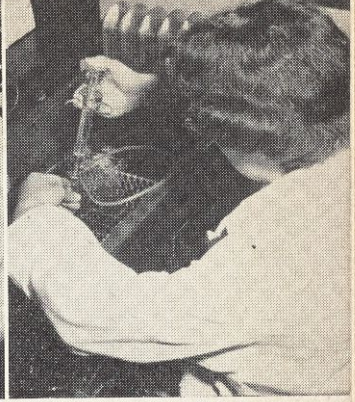
Learning more about the nature of milk; how its flavors affect butter quality.