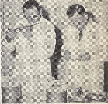
Keen observation is necessary to grade butter for color, texture and flavor.