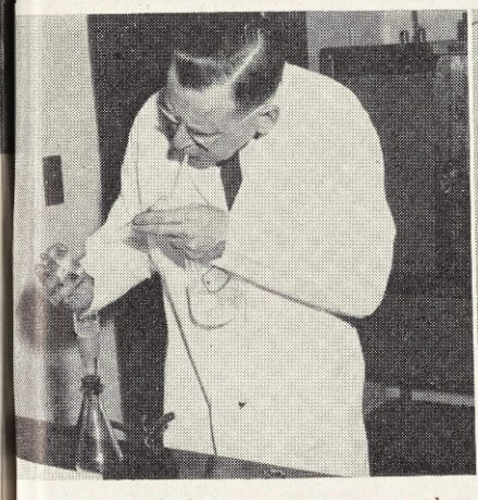
Butterfat tests on creamery samples show North Dakota butter now meets legal standards, 80 percent fat is required.