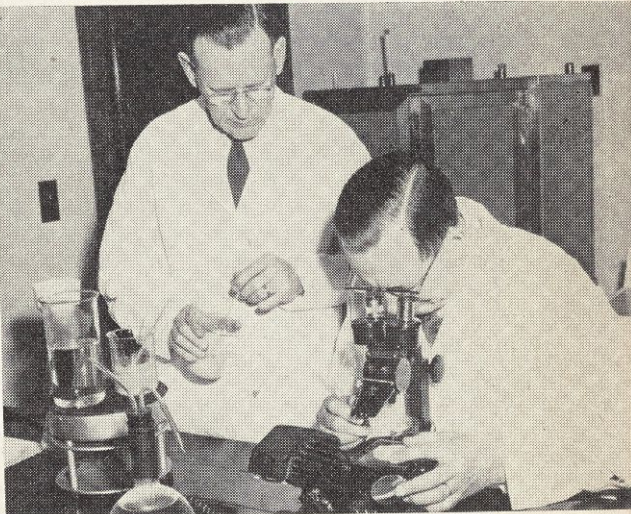
Sediment tests show North Dakota butter is clean. Quality is higher than when project was started 10 years ago.