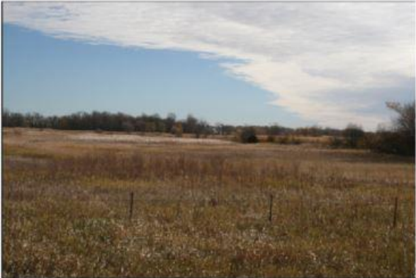
FIGURE 35: Site View facing West