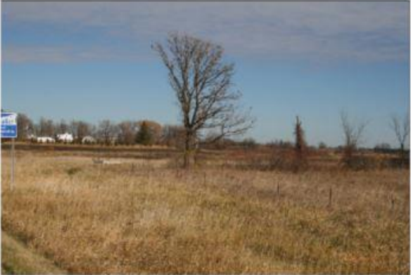
FIGURE 32: Site View facing North