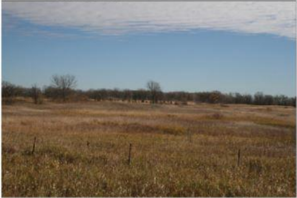
FIGURE 31: Site View facing East