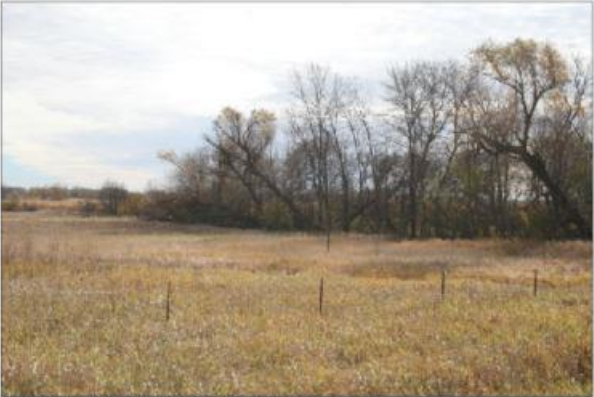
FIGURE 33: Site View facing South A