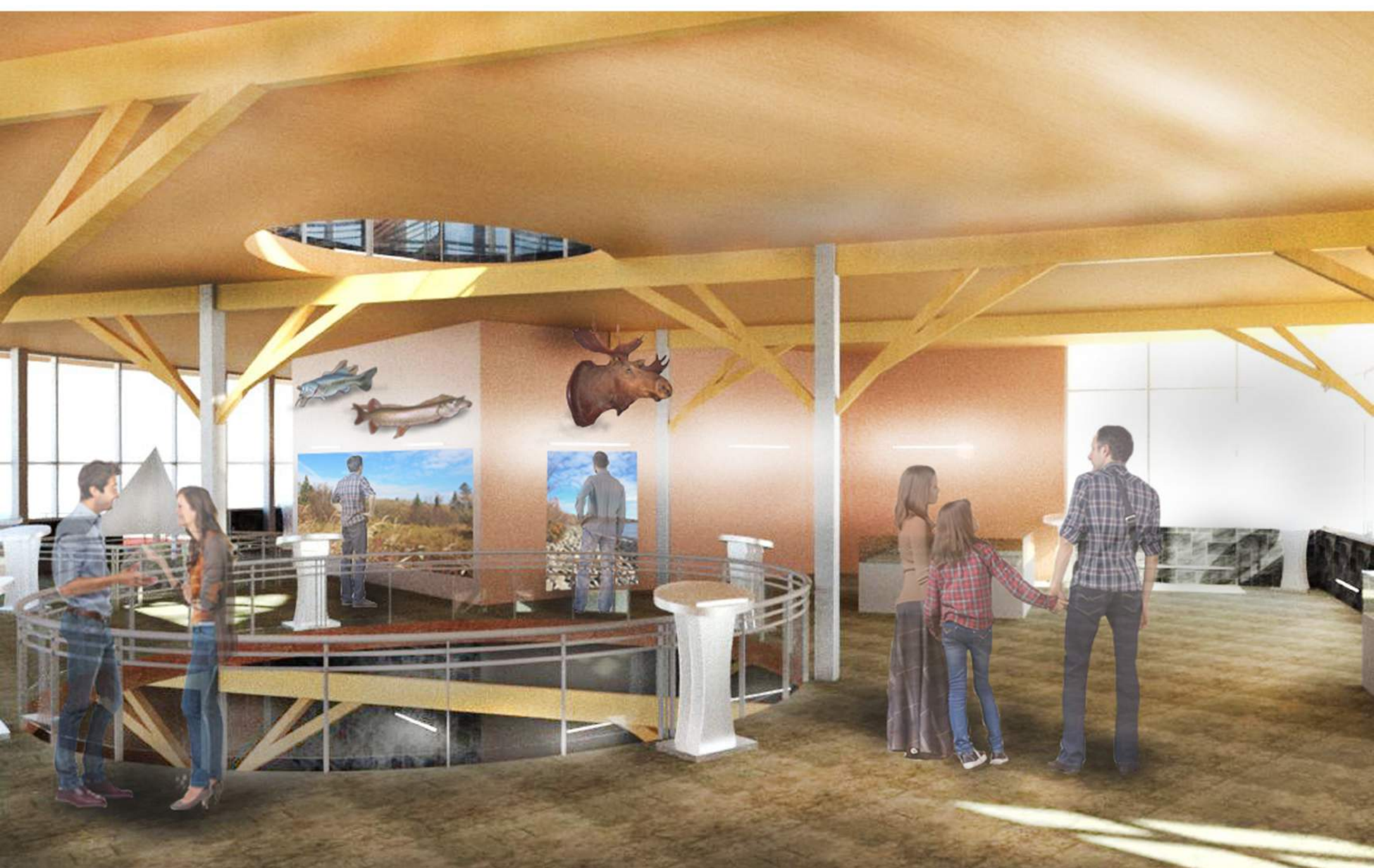
Second Floor Exhibits