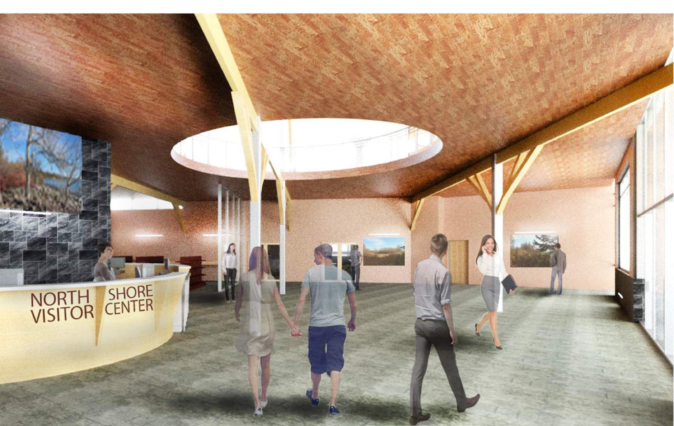
Main Floor Gathering