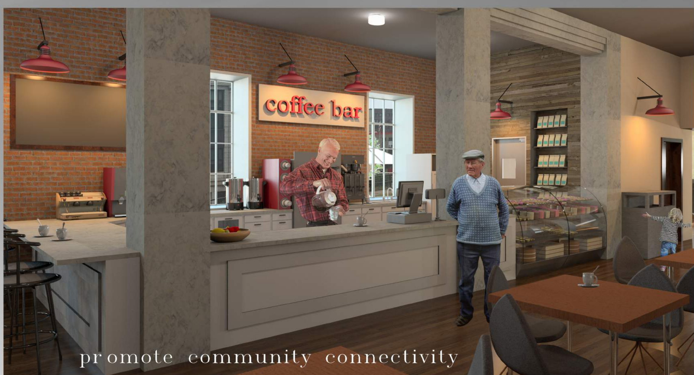
promote community connectivity