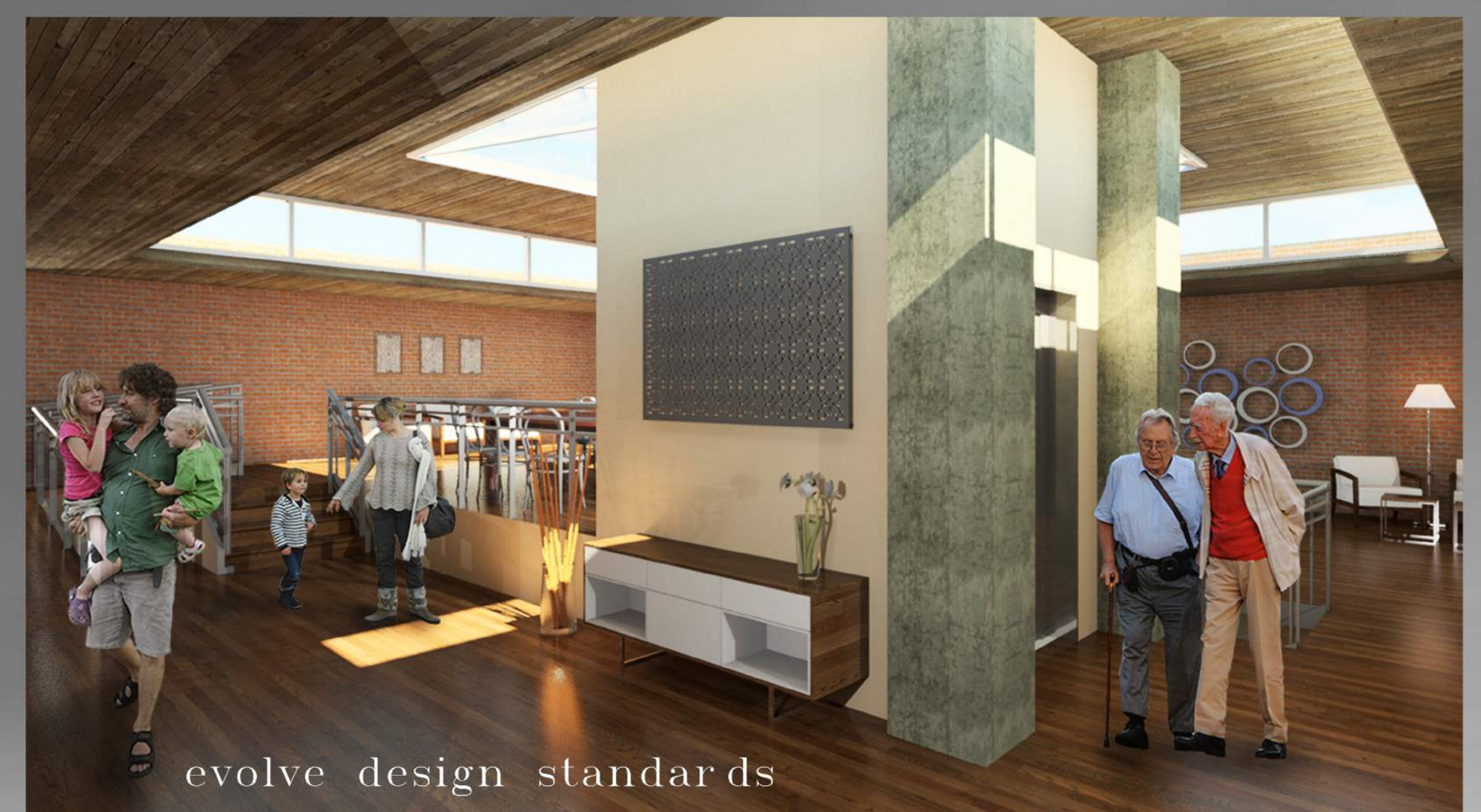
evolve design standards