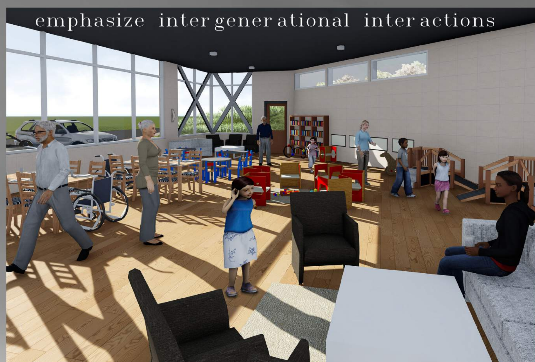
emphasize intergenerational interactions