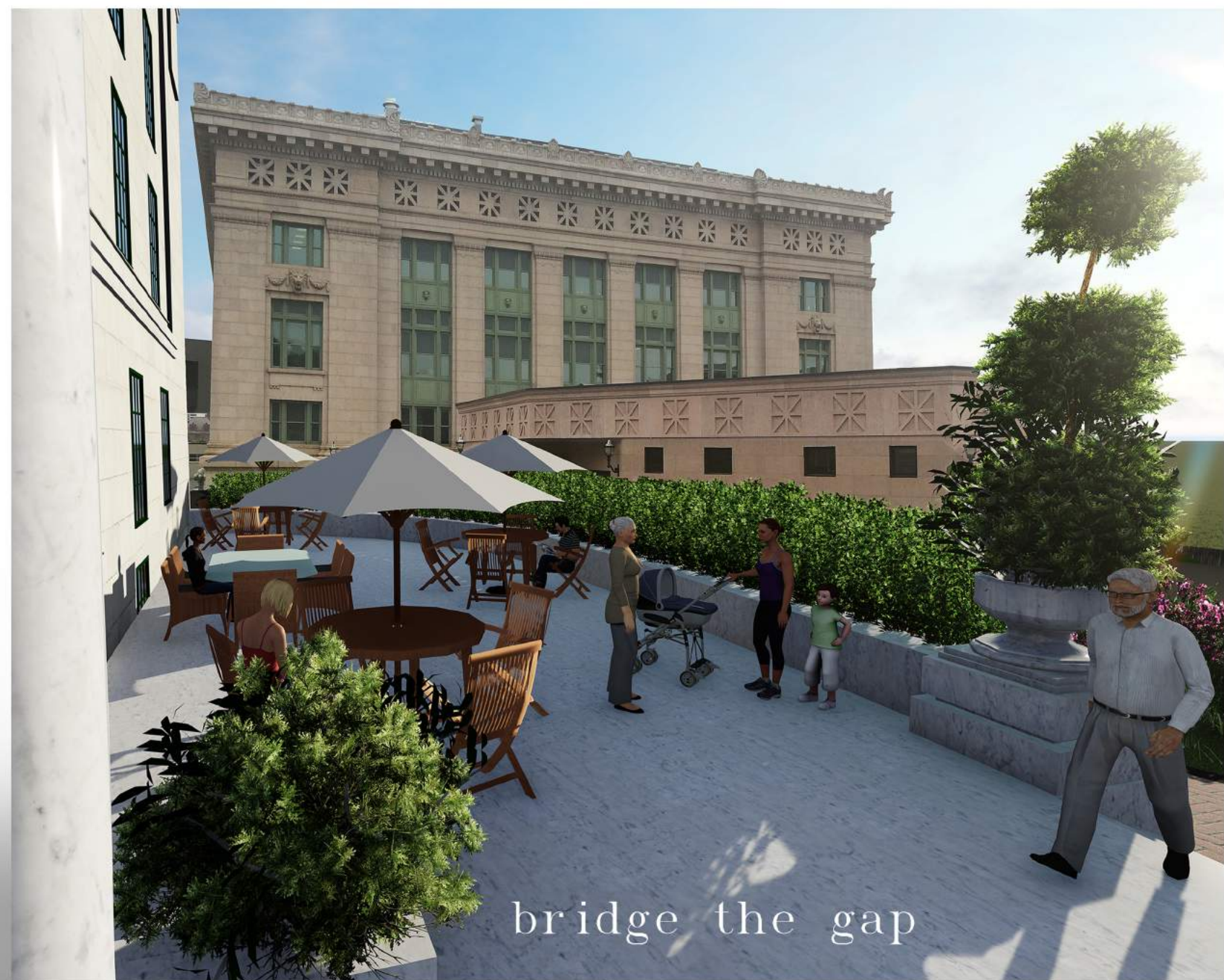
bridge the gap